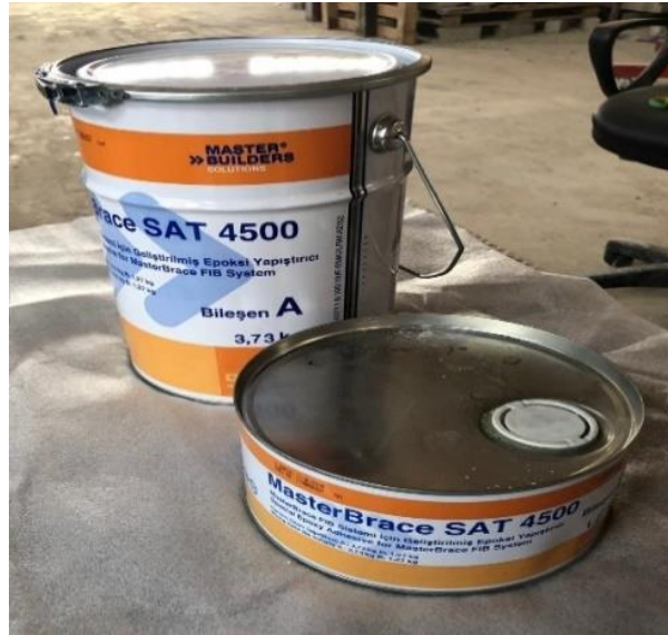
Figure 2. Epoxy resin used for bonding of BFRP sheets.