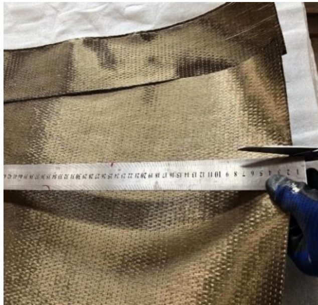
Figure 1. BFRP sheet sample.

The concrete cylinders were confining with unidirectional BFRP sheets. This type is known for its fire resistance, accessibility, smooth texture, durability, low price and high tensile strength as compared to others types of BFRP fabrics [42]. The used BFRP fabric has a thickness of 0.3 mm and a weight-to-area ratio of 0.3 kg/m 2 , while its tensile strength, modulus of elasticity and elongation are 2100 MPa, 105 GPa and 2.6%, respectively as shown Figure 1.