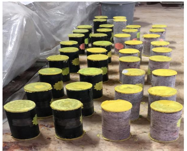
Figure 3. Steps of confining process and heating.