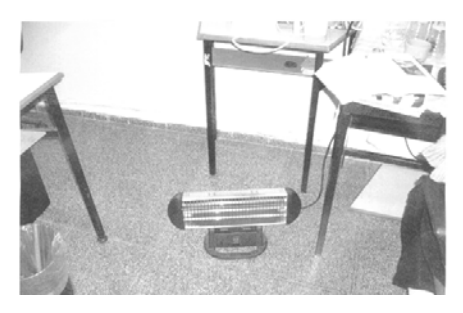
Figure 7. Room with an electric heater in it

Within the scope of the qualitative data, the students conducted interviews with 25 instructors from blocks A and B (block A: 10; block B: 15). Three of 15 instructors from block B and all the instructors from block A used electric heaters. The preservice teachers also took photos of the instructors' rooms with electric heaters. They included some of these photos in their project poster. Figure 7 is a photo of an instructor's electric heater in block A.