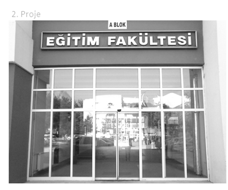
Figure 8. New entrance door of block A

The pre-service teachers stated in the poster prepared for this second project that the results of their project could have a national and global influence.