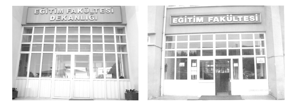
Figure 3. Entrance door of block A Figure 4. Entrance door of block B

Pre-service teachers in the second year's project group aimed to improve the project described above by redesigning it, first seeking reasons for the original project's non-completion under the instructor's guidance and second expressing the research problem and sub-problems in more testable ways. The research problem was amended as follows: "Is there any temperature difference between block A and B of the school of education?" The pre-service teachers observed that two university buildings had the same architecture, but the entrance door of one was broken and thus always open, while the entrance door of the other building was hydraulic and closed when not used. The project poster included photos related to these observations (Figures 3 and 4).