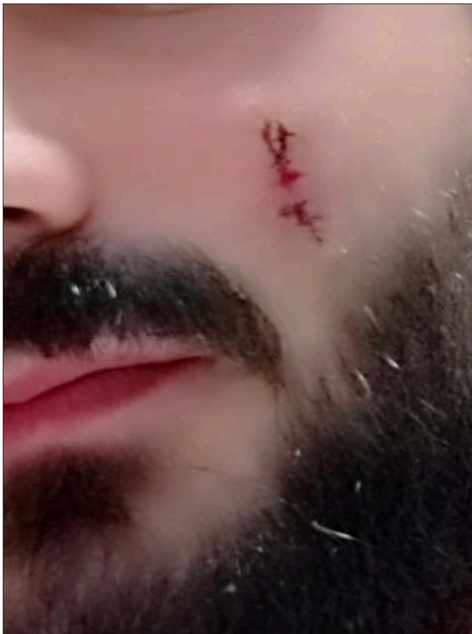
Figure 1. The first Figure of the patient operated in the plastic surgery clinic.