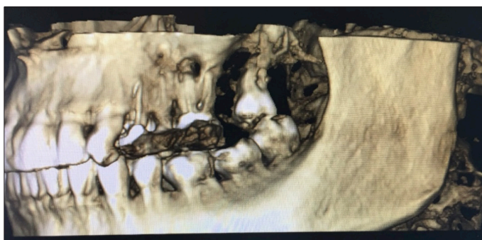
Figure 4. CBCT section obtained from the patient.

(Augmentin 1 g 14 tablets, GlaxoSmithKline, Istanbul, Turkey), and analgesic (Arveles 25 mg film tablets, (Menarini, L'Aquila, Italy)) and mouthwash, and postoperative information and recommendations were given to him. An appointment was scheduled one week later to make the control and remove the sutures. One week later, the extraction site healed in the intraoral control of the region, and the sutures were removed. During the extraoral examination, exudate outflow was not observed in the fistula region. In this session, the dressing was made to the region with Batticon (Poviodeks Batikon, Kimpa), and the patient was given a control appointment again two weeks later. When the patient came to the hospital two weeks later, it was observed in the extraoral examination that the fistula closed. There was no pain and swelling in the patient between the control sessions. The patient was given a new control appointment three months later, and during this session, it was observed that the fistula region healed with scar formation and closed completely (Figure 5). After these controls, the patient was referred to the plastic surgery clinic for an aesthetic evaluation of the skin region that healed with scar formation. The plastic surgeon started treatment with Dermatrix silicone gel for the patient and aimed to treat the immature apparent scar with this gel.