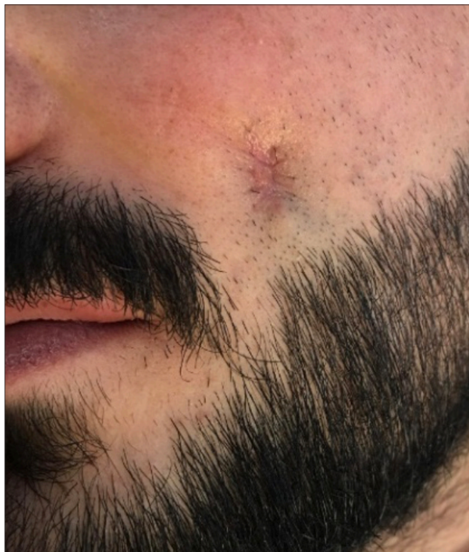
Figure 5. The patient's fistula region healed with scar formation and closed.

The causes of the failure of root canal treatment are now shown as necrotic pulp tissue, broken instruments, flooded root canal filling, mechanical perforations, root fractures, periradicular lesion and periodontal disease, while the most significant reason for the failure is microorganisms in the root canal system. While an apical inflammation caused by bacteria becomes chronic in one individ-