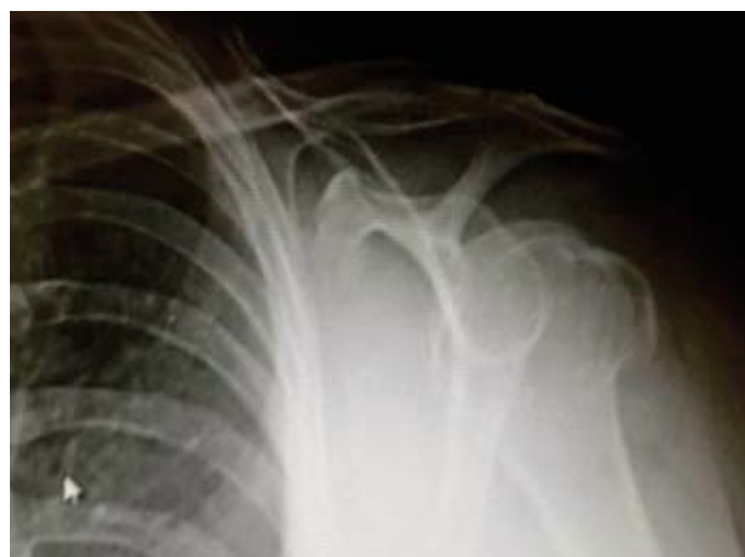
Figure 6. Case 3- Bilateral shoulder dislocation left shoulder radiograph