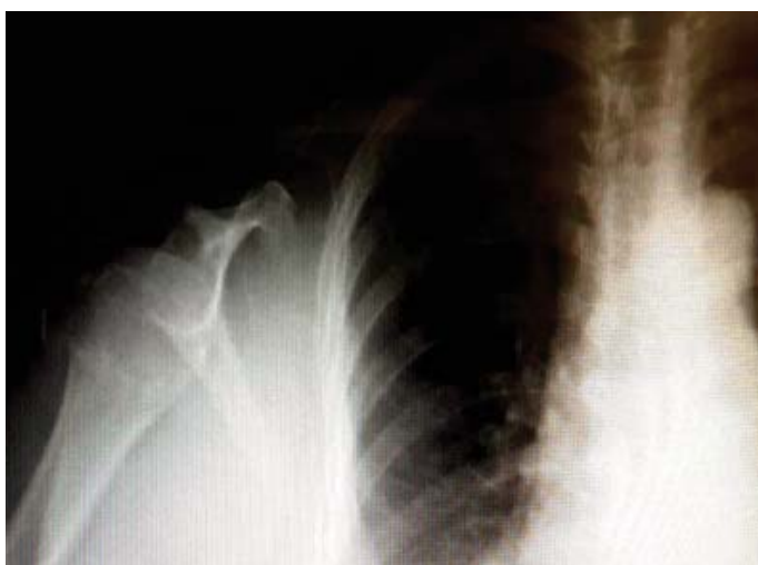
Figure 5. Case 3 -Bilateral shoulder dislocation right shoulder radiograph

Glenohumeral dislocations are the most commonly observed ones among all large joint dislocations. They occur as a result of trauma in many young men. It is followed by dislocation in elderly