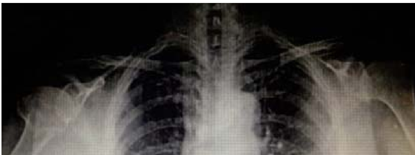
Figure 7. Case 3-Bilateral shoulder dislocation and tuberculum majus fracture radiograph after closed reduction