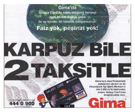
Image 1. A Gima retail store advertisement in Milliyet promoting the GalaxyCard: "Even a watermelon can have 2 monthly installments." Consumers are invited "to purchase 41,000 different products with 2 monthly installments in Gima retail stores. No interest, no downpayments."

these advancements in the credit card market in his column in Milliyet on March 6, 2002, as "now even the bread is sold in 2 monthly installments" (Uras, 2002, p. 7). Even a recent survey by the Ministry of Commerce in 2018 on consumer profiles underlined the most significant reason for consumers to use a credit card in their purchases to be its installment feature. According to the survey, the installment feature is the most frequent answer for all income groups to the question of why they have a credit card (Güzel et al., 2018, pp. 98, 100).