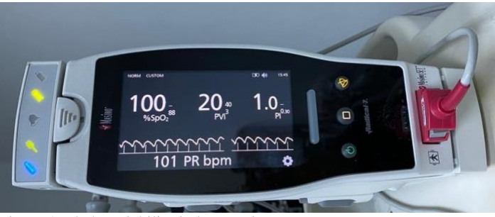
Figure 1. Pleth variability index monitor.

blood pressure (BP), heart rate (HR) and electrocardiogram (ECG) (Fig 1) (Fig 2).