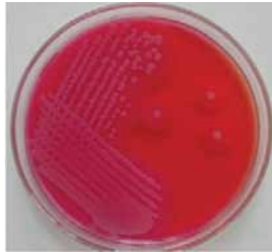
Figure 2. Typical Growth of Bacillus cereus on MYP agar pink colonies surrounded by zone of egg yolk hydrolysis.