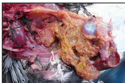
Figure 1. Multifocal small grayish-white nodules in the abdominal cavity the around visceral organs.

Hjarre's disease appears to be a very rare disease, reported occasionally in birds, also has been described in quails (Da Silva et al 1989, Banlunara and Lekdamrongsak 2006). The pathogenesis is unknown, but the route of infection, seems to be gastrointestinal, skin or respiratory tract. Factors including limited feed intake, vitamin A deficiency, parasitic infections and genetic susceptibility have been suggested to be predisposing risk factors for coligranuloma in poultry (Wray and Davies 2001, Banlunara and Lekdamrongsak 2006, Islam et al 2007, Nouri et al 2011). All of these reports suggest that the presence of coligranulomas cannot be explained by infection with alone. However, must have acted as a primary pathogen when the immune sufficiency of the bird was decreased by an immunosuppressive disease (Nouri et al 2011). Coligranuloma can result in emaciation and reduced production that may not be noticed clinically and often is identified during necropsy (Da Silva et