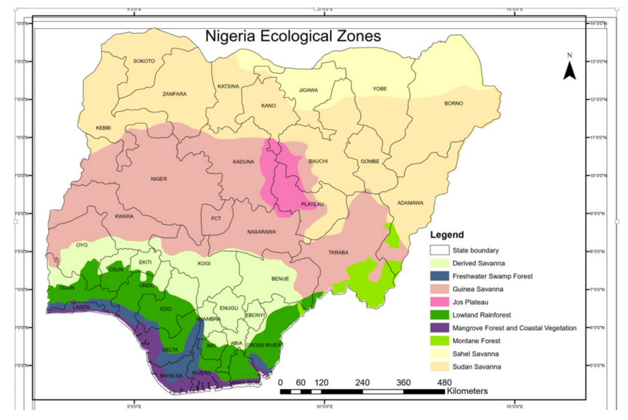
Figure 2. Nigeria Ecological Zones<sup>55</sup>

nutritious species, including 600 blades of grass, 540 herbaceous legumes, 380 browse species, and over 600 others of lower nutritional values.<sup>54</sup>