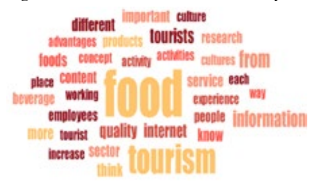
Figure 1. General word cloud of the study

When talking about food literacy, and the importance of tourism personnel being food literate, the first expressions in the mind of participants were "content, quality, culture, information, knowledge, service, and experience." Most of these words became codes and themes when the readings are detailed. Also, it won't be wrong to say these are some of the ingredients of the food literacy domains.