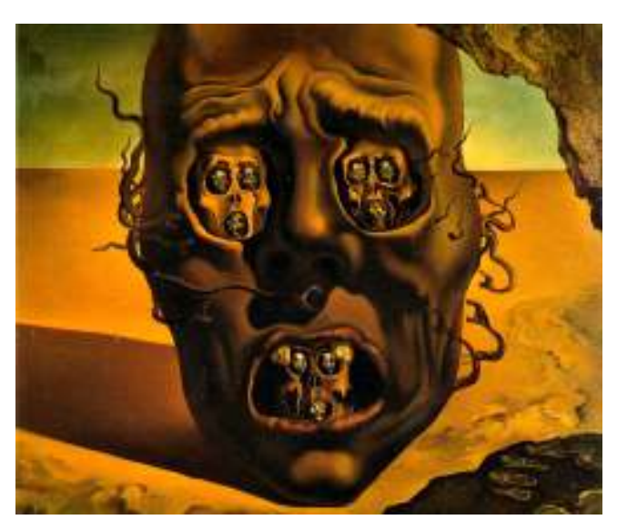
Resim 1. Dali, Salvador. "Face of War", 1940-41, Oil on panel, 100 cm x 79 cm, Museum Boijmans Van Beuningen, Rotterdam.