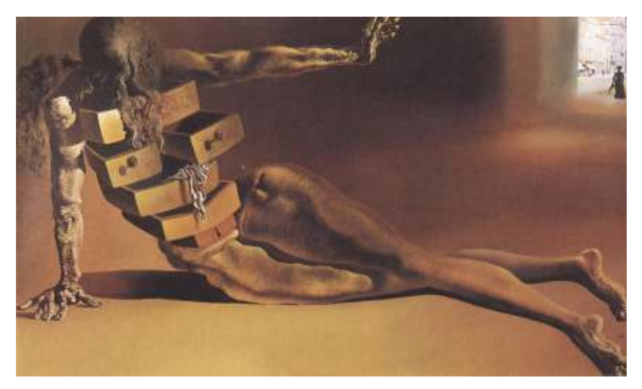
Resim 2. Dali, Salvador. "The anthromorphic Cabinet, 1936", Oil on panel, 25 cm x 43 cm, Kunstsammlung Nordrhein-Westfalen, Düsseldorf, Germany.

In this work, Dali has multiplied the drawers of a cabinet from the breast of a woman to her abdominal region in various partitions and sizes. The women figure is illustrated sitting laterally on her right hand while her hair covers her face because of her inclination. The left hand of the figure is turned towards the light from the upper right corner of the picture and points at the human crowd there. It is possible to list similar styles of work of the artist such as, "The Burning Giraffe, 1936-37", "Venus de Milo with Drawers, 1936", and "Women with Drawers, 1936". The common feature of Dali's pieces of art above is the ambiguous and interesting affinity of the figure and the objects like the drawers of a cabinet. Due to the "collage" method of the artist, it is possible that the human figures and the non-human symbolic objects institute different meanings. For instance how is it possible to figure out a meaningful outcome from the work of the artist such as The Antromophic Cabinet ?