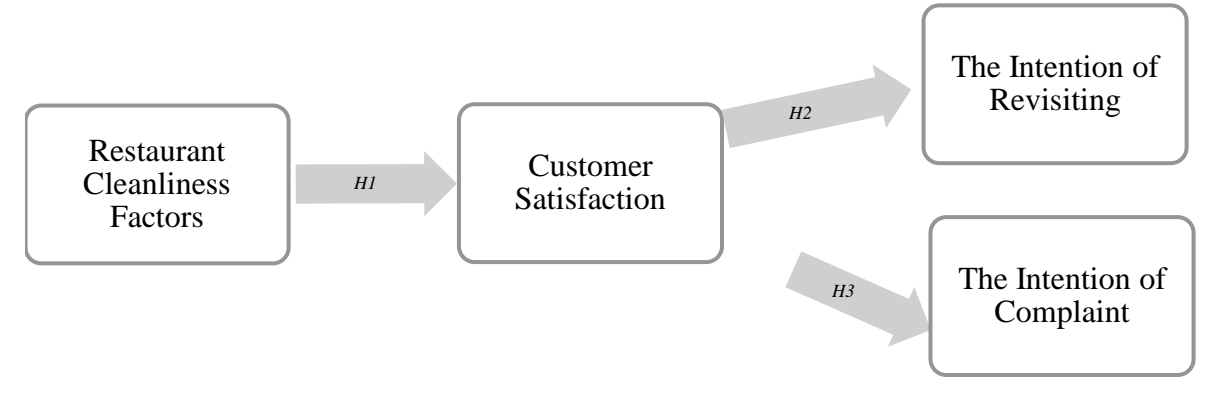
Figure 2. Research Model