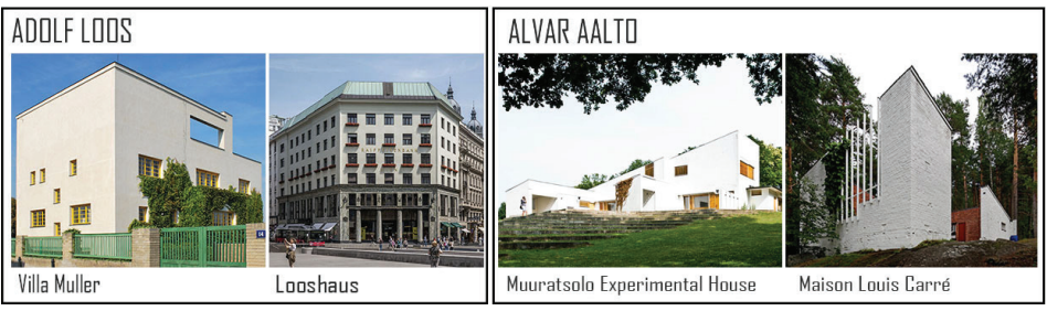
F. 2: Building examples of Loos and Aalto's design approaches (https://www.archdaily.com)

Forming these individual characteristic approaches, each has a turning point in which they are affected by their mental mechanism, cultures, lifestyles, different experiences and social events. Therefore, these minds, which unite on a specific common ground with similar approaches or new experiences, determine the periodic styles that make up the movements called "-ism", just like in modernism. As a result, like Minor states, a period or culture becomes apparent in style<sup>13</sup>.