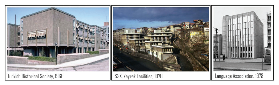
F. 5: Various designs of non-Western modernist architecture in Turkey

From the 1970s, this monotony was replaced by diversity and heterogeneity<sup>31</sup>. In this context, examples of buildings in which the international style is built-in non-Western contexts with a modern understanding without moving away from the tradition can be mentioned