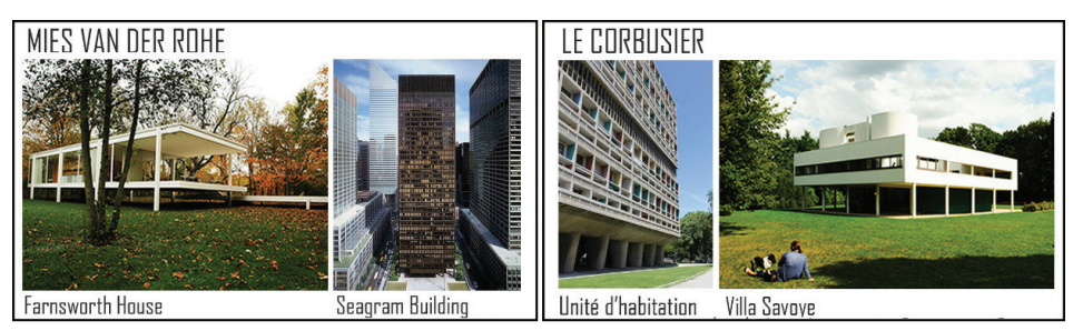
F.1: Building examples of Rohe and Corbusier's design approaches

Mies van der Rohe focused on searching for total space and skyscraper architecture. Adolf Loos made groping mass volume and function experiments, Le Corbusier did formulation experiments and research, and Alvar Aalto dealt with adapting the context to modern ideology. These approaches reflect the different workings of the minds of modernist architects (F. 1, F. 2).