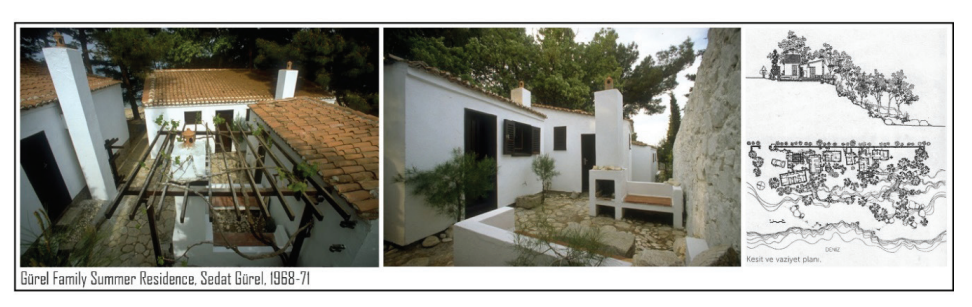
F. 7: A house design of non-Western modernist architecture in Çanakkale, Turkey (https://www.arkiv.com.tr) (Hasol, 20. Yüzyıl Türkiye Mimarlığı, 190)

traditional architectural and environmental features ( F. 7 ). The most distinguishing feature of this design, which consists of living units around a courtyard, is organized in harmony with the natural environment, the landscape, and the user's actions<sup>33</sup>. This example can be counted as one of the local and original modern approaches in non-Western contexts in designing it with modern and abstract lines, considering the climatic characteristics and traditions.