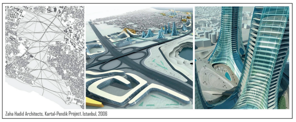
F. 9: A contemporary residential example of digital design in a non-Western context, Istanbul, Turkey (Schumacher, "Parametricism: A New Global Style for Architecture and Urban Design", 241-255)

temporary living spaces as well as service structures, creates a different habitat within itself, independent of the life and built environment in the city of Istanbul. This means that it cannot fit into the context in which it is (F. 9). In today's world, these approaches are becoming one of the factors that reduce the authenticity of architectural forms and designs.