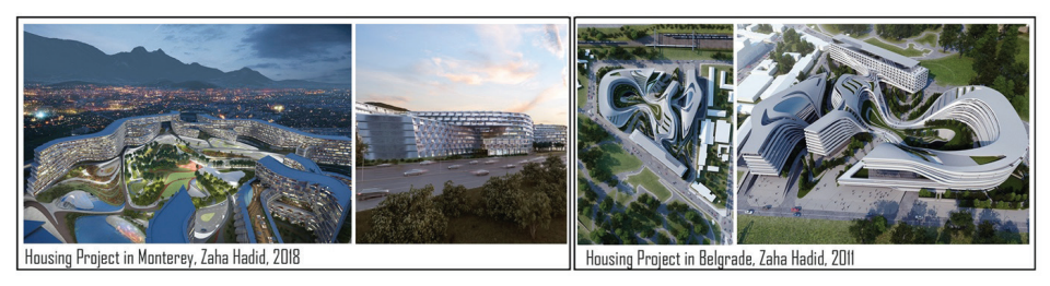
F. 8: Contemporary residential examples of digital design in different Western contexts

varies according to subjects, historical processes, and the techniques they use, just like in modernism. These design models, which form the current technological style, are expressed by Kolarevic as digital design and production systems. These models have become more diverse over time and are now used in many urban buildings, including residential buildings ( F. 8 ). According to Kolarevic, these computational and digital architectures consist of non-Euclidean spaces, topological approaches, genetic algorithms, kinetic and dynamic systems, unlike the modern architecture of the industrial era<sup>38</sup>