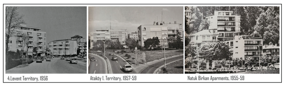
F. 4: House designs with international modern style in Turkey (Hasol, 20. Yüzyıl Türkiye Mimarlığı, 144-147)

On the other hand, modernism aims primarily at replacing all the historical styles with a new construction culture. In this new building culture, it is hoped that form will be considered together with components such as program, function, location, budget, materials, and construction, not as a primary stylistic decision. This refers to an architecture that is suitable for the context in which it is located, whose form can change according to various places, and which is universal in terms of design principles<sup>27</sup>. Therefore, it can be said that, particularly in non-Western contexts, modernism becomes more authentic when manipulated without being placed in some mold, international style or universal form. As Güzer said, the context forces the architectural object to be different, to become authentic and to move away from imitation<sup>28</sup>. Even in the early days of modernism, there are different interpretations and different contexts. These differences in development and interpretation in Western and non-Western societies demonstrate that universality is perhaps not only stylization based on form. The adaptability of the central idea and the knowledge of the various cultures may also make a claim of universality.