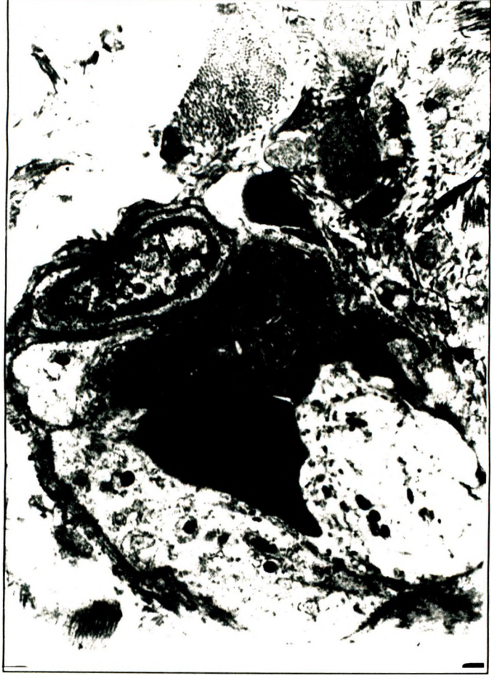
Fig 4. Electronmicroscopic view of a lesion taken one month after the treatment showing reduced capillary luminal spaces and endothelial cells projected into the lumens. (Arrow). Collagen fibrils accompanied by fibroblasts and macrophages were established all around the perivascular areas. X 6000.

Fig 3b. Widespread fibrosis and hyalinization are shown in perivascular areas of specimen taken one month after the treatment. HE X 100