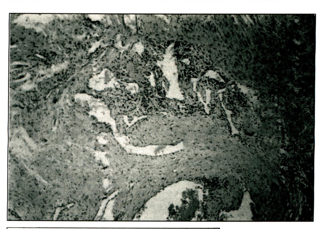
Fig 3b. Widespread fibrosis and hyalinization are shown in perivascular areas of specimen taken one month after the treatment. HE X 100