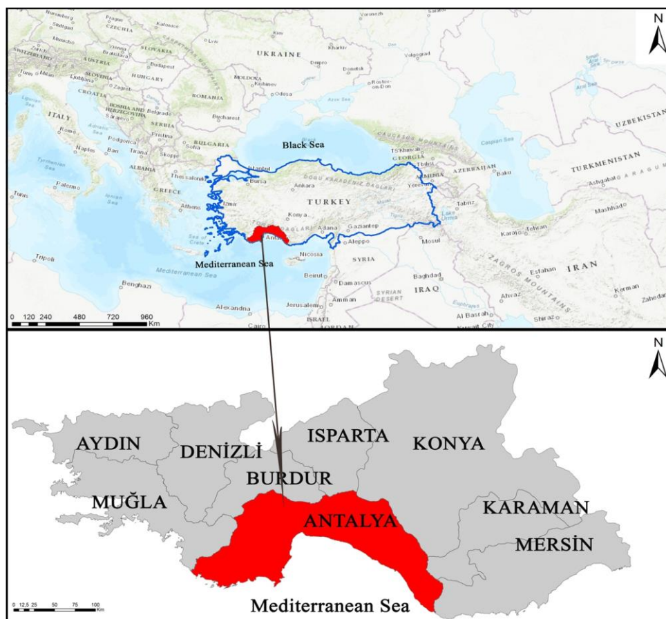
Figure 1. Geographic location of Antalya

This study was carried out in Antalya, which is the fifth-largest city of Turkey. Antalya is a province that is widely preferred as a residential area for its geographical location and climatic and edaphic conditions. Besides that, since it is one of the most important hotspots for the tourists, it is considered as the capital city of tourism. For these reasons, population gradually increases, and it becomes a necessity to open new residential areas [31]. The geographical location of study area is illustrated in Figure 1.