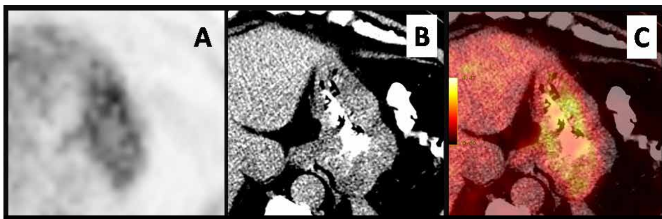
Figure 1. PET (A), CT (B), and PET/CT Fusion (C)

Salih ÖZGÜVEN, Fuat DEDE, Tunç ONES, Sabahat İNANIR, Tanju Yusuf ERDİL, Halil Turgut TUROGLU