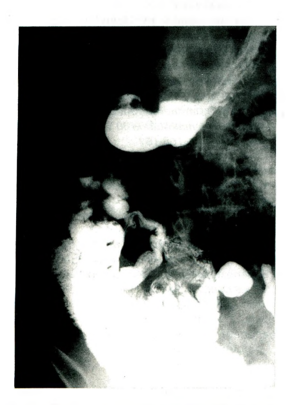
Fig.2: Barium examination shows jejunum on the right side of the abdomen.