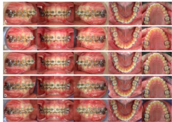
Figure 3. A, B, C, diastema closure; D, E, interproximal enamel reduction.