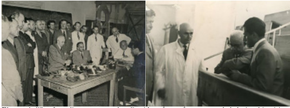
Figure 4. The foot diseases exam that President Ismet İnönü attended during his visit to Ankara University Faculty of Veterinary Medicine (1949)