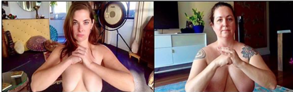
Image 5. Spencer Tunick, Nurses, Stay Apart Together, 2020.

While the act of being naked in that public space has always been a focal point of Tunick’s art, in “Stay Apart Together” he has replaced public spaces with private ones instead. Rather than taking the naked body into the public realm this time, in this project he captures his participants in and along with the private realms in which they dwell thereby rendering those realms public.