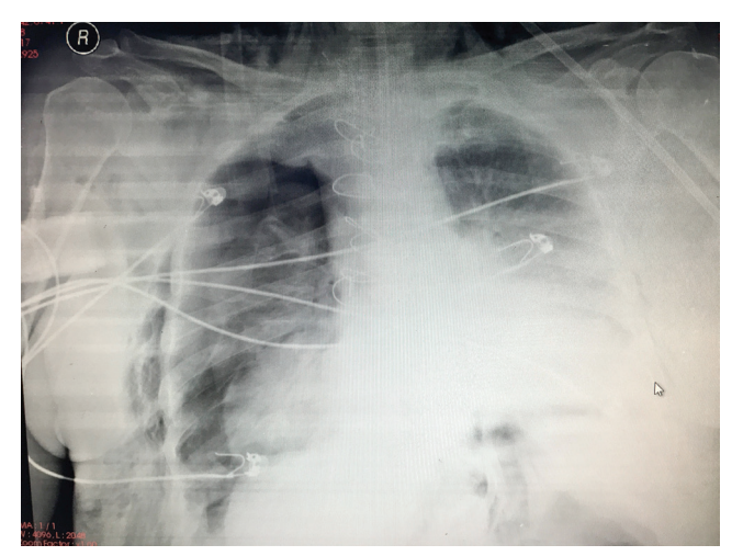
Figure 1. Chest x-ray showing right-sided tension pneumothorax and free air under diaphragm.

Massive pneumoperitoneum led to elevated peak airway pressure and ineffective mechanical ventilation with progressive hypoxemia. Air evacuation from the peritoneum was performed using a 7 French percutaneous venous central line and