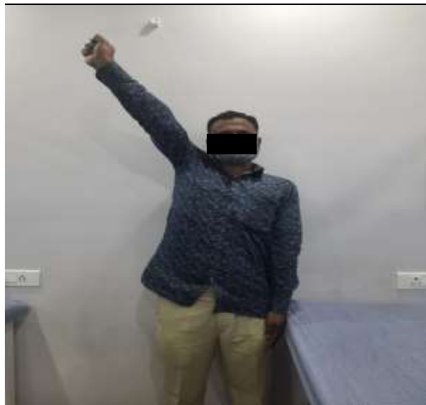
Figure 9. Shoulder abduction