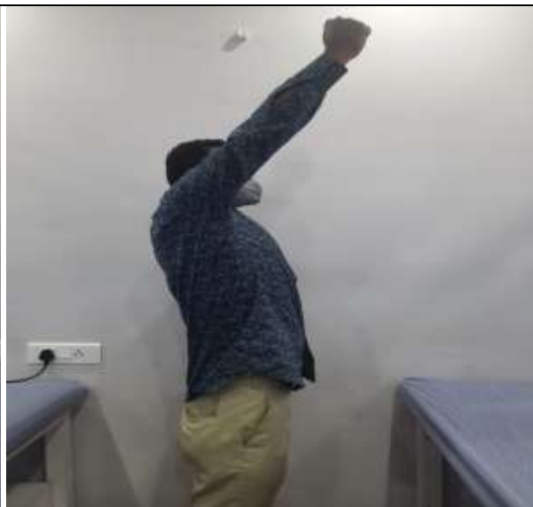
Figure 10. Shoulder flexion