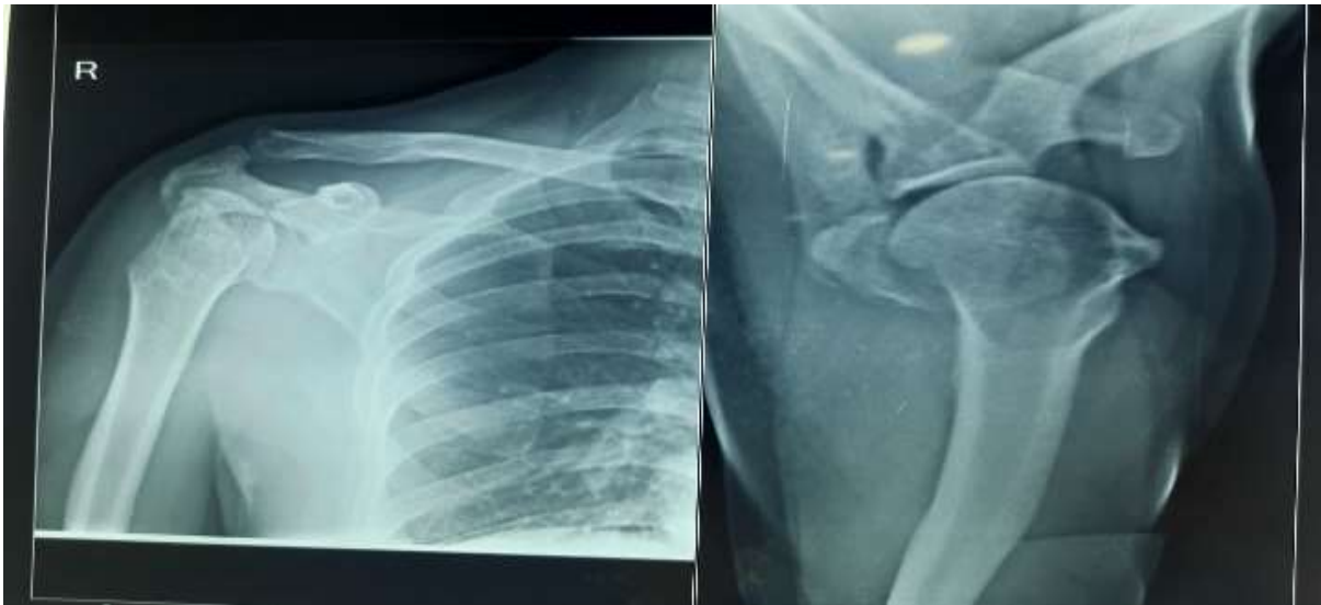
Figure 1,2. Plane radiographs findings revealed a displaced fracture of the greater tuberosity.

shoulder i.e., 160^{\circ} of shoulder abduction (fig no 9), 170^{\circ} of shoulder flexion (fig no 10) extension 30^{\circ} , internal rotation 60^{\circ} , external rotation 50^{\circ} . Strength (4/5) of his rotator cuff muscles. He was relatively pain free. Now, he can successfully perform overhead activities with necessary strength. In addition to meeting the criteria for returning to work.