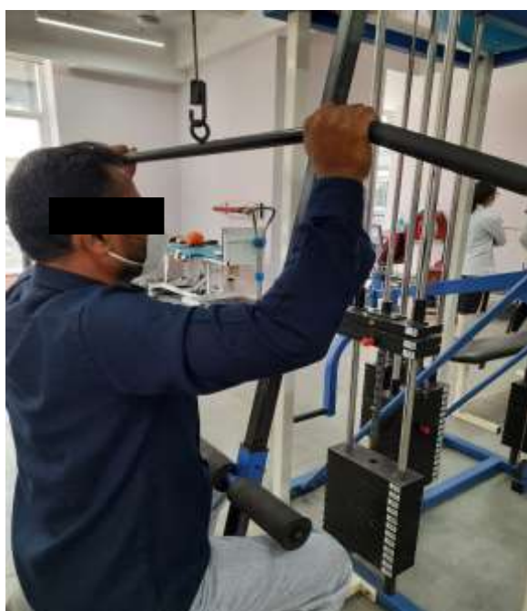
Figure 11. Overhead activities using weight