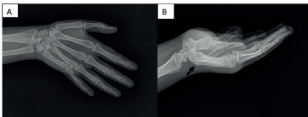
Figure 1. A) AP and B) lateral radiographs of the first arrival at the hospital, arrow; undiagnosed 5th CMC joint dislocation.