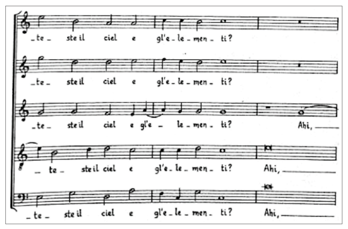
Figure 9: "Ahi"s begin after the death of the bird (Banchieri, 1997, p. 85).

The next movement's text is by Agostino da Padova, and it is a lament for a bird killed by a cat (Anderson, 1995). Beginning with the words "augellin lascivetto" ("playful bird"), a canon is initiated between canto I and II. Another imitative entry takes place in measure 26, where bass imitates canto I from a 5th down, although it is not exact. In fact, it is not easy to find strict and long imitations of J.S. Bach in this era, but even little touches of imitation make the music incredibly energetic and keeps its audience interested. The 2nd stanza describes what a sweet creature the bird is. When it ends, and the agony that arises from its death begins (Figure 9), the composer suddenly starts bringing longer rhythmic values into play (especially on the words "ahi," since it is a custom in Renaissance music to "suffer" on longer note values).