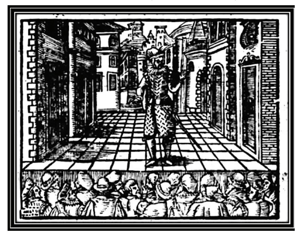
Figure 6: Depiction of L'Humor Spensierato in the facsimile (Banchieri, 1604).14

A characterized concept, Carefree Humor sings in the prologue which is very short. F major dominates the movement, with the exception of E-flats occurring to hint at the F-Mixolydian mode. L'Humor Spensierato (Carefree Humor) (Figure 6) calls for the banishment of sadness and orders "silence in this meadow." He wants everyone to be attentive and stay silent. These lines