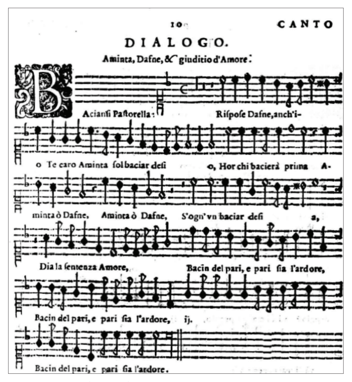
Figure 10: Canto part of Dialogo (Banchieri, 1604).

The thirteenth movement is a quintessential "torment madrigal" of the Renaissance, where Banchieri makes use of chromaticism as never before in the work, in order to empower the spirit of the text. Especially between measures 15 and 20, on the words, "anzi si stempra in angoscioso guai," ("but languishes in bitter woes") chromatic sounds are abundant. Banchieri's own poem, Ergasto appassionato (Passionate Ergastus) is about the grievance of a lover which ends with the words, "to have to live content, and to die in torment." This is the second time in the work that a D minor chord starts a movement. It quickly dissolves into a B-flat major chord which is VI, but with a chromatic ascend to B-natural and then C-sharp in the bass pushes the sound back unto the level of D minor. In the last four measures, the composer cleverly changes the D minor chord from tonic to subdominant and escapes to A major for a fresh cadential sound.