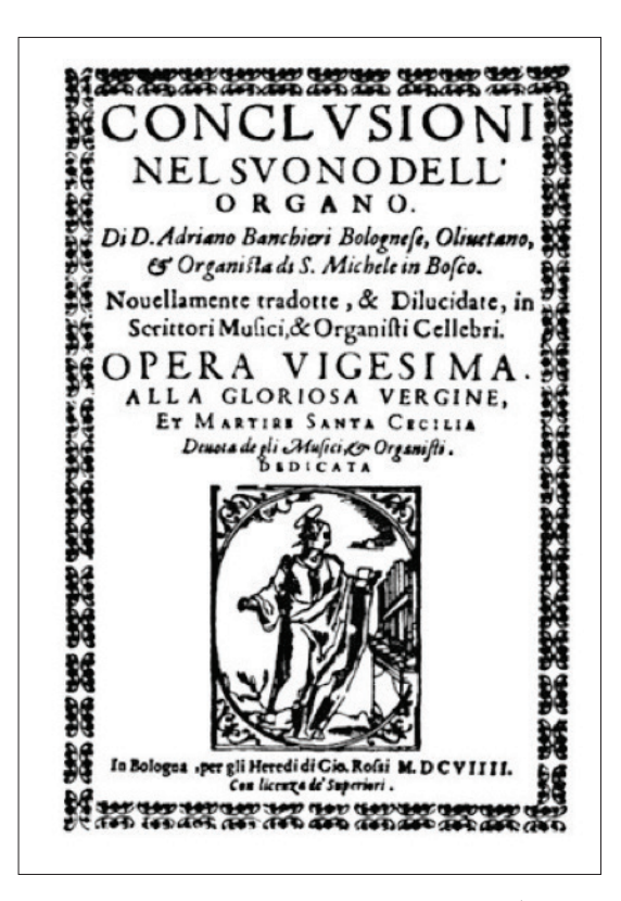
Figure 3: The cover of Conclusioni del suono dell'organo (Banchieri, 1609).