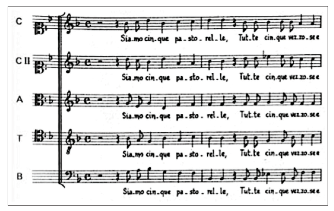
Figure 7: The beginning of the Danza di Pastorelle (Banchieri, 1997, p. 63).