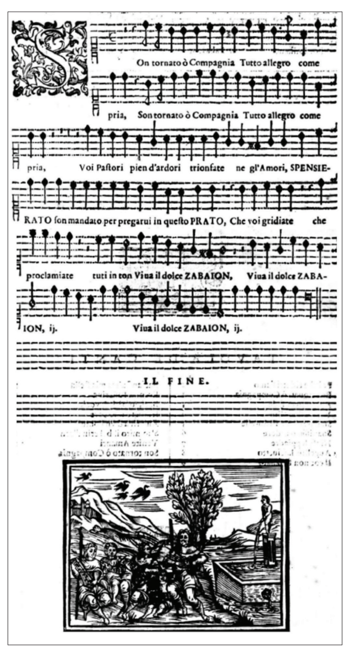
Figure 11: The last movement of the piece, canto part (Banchieri, 1604).

Next is the Gara amorosa di pastori (Shepherd's Love Contest). Here, two madrigals are interwoven with the top three lines (females) singing the first, and the bottom two (males) singing the second which is in accordance with the "contest" idea. In this movement, Banchieri writes the most extreme chromatic structures that one can see in this work. After the two lovers proclaim their love, the time signature changes to triple meter,<sup>16</sup> and the two groups come together, singing the words "let us sing no more, here are the shepherds, to dance through these flowers ... " In this closing section, the music suddenly gets faster in tempo, and the feeling of a festival dominates the atmosphere as the music gets more and more joyful. This aura is maintained in the next movement,