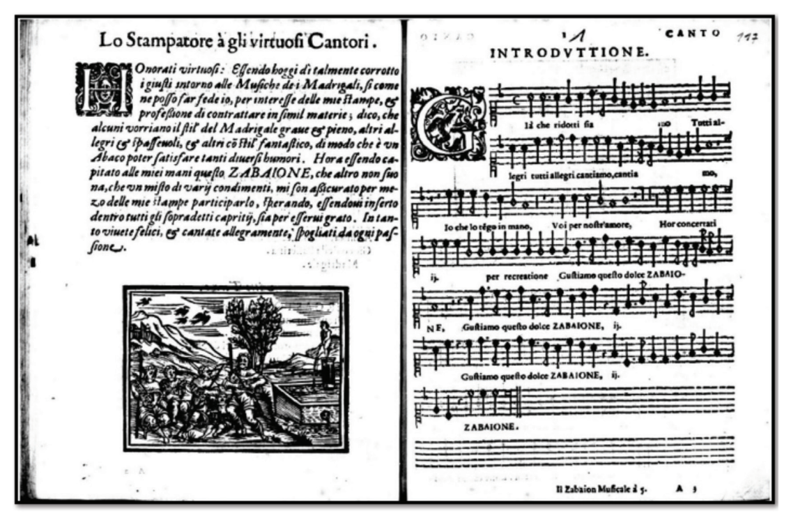
Figure 5: Facsimile of Il Zabaione, canto part from the introduction (Banchieri, 1604).

This opening creates a smooth and interesting transition from the murmuring atmosphere created by the audience before the performance. The first two lines are sung by the whole choir, then the tenor takes on the task of distributing the parts and he asks the questions. Each singer for the respective part responds to him. When he asks about the tenor, the other singers respond "You, if you will." At that spot, the direction of the melodies and harmonic procedures make