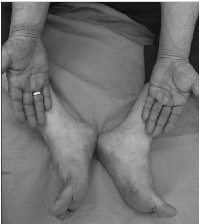
Figure 1. Livid colored painful edematous plaques and pigmented macules on the palms and soles

HFS is characterized by acral erythema, numbness, tingling, dysesthesia or paresthesia on the palms and soles. These findings are rarely seen on the body, neck, chest, scalp or extremities 1 . In advanced cases, desquamation, ulcerations, and blisters may occur following edema of the skin accompanied by pain. In our case, livid colored painful and edematous plaques, pigmented macules were detected both on the palmoplantar and dorsal parts of the hands and feet as well as diffuse hemorrhagic bullae and erosions under the tongue. Two different studies revealed HFS and stomatitis, as the most frequently encountered adverse events caused by capecitabine 8,9 . The frequency of side effects concerning the oral mucosa described as stomatitis or mucositis of all grades occurring with capecitabine has been reported to be 11-15%. Although the underlying pathogenetic mechanism of capecitabine, causing stomatitis is not well documented, its stomatitis causing effect has been ascribed to a toxic effect on the basal keratinocytes and upper corion microvessels of the oral mucosa, with inhibition of DNA synthesis causing a subsequent apoptosis and decreased salivary flow rate 10 . Hemorrhagic bullae and ulcers of the oral mucosa observed in our patient were classified as grade 3 stomatitis but the literature lacks information about the formation of hemorrhagic bullae of the oral mucosa as observed in our case. There is only one case,