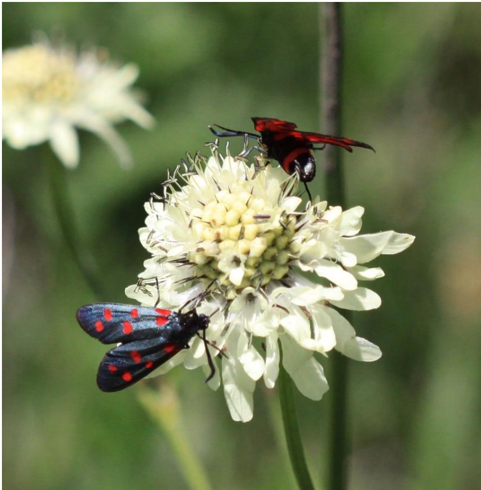
Fig.5. Zygaena (Zygaena) dorycnii . Ardahan, 41°01'07" N; 42°25'06" E, 2067 m.