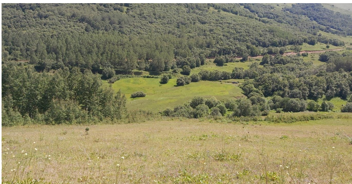
Fig. 7. The habitat of Zygaena armena in Ardahan (B12, 31.VII.2021)