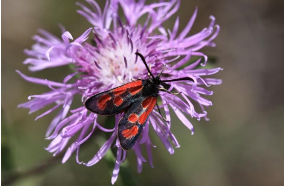
Fig.4. Zygaena (Agrumenia) armena . Ardahan, 41°29'0" N; 42°40'70" E, 1818 m.