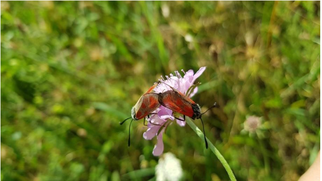
Fig.3. Zygaena (Agrumenia) loti . Kırklareli, Kaynarca, 41°41'42" N; 27°28'54" E, 300 m. Photo: F. Can.

Zygaena (Zygaena) lonicerae (Scheven, 1777): B9 , 15.VII.2021, photo: E. Karaçetin; B10 , 17.VII.2021, photo: E. Karaçetin; B12 , 01.VIII.2021, photo: E. Karaçetin.