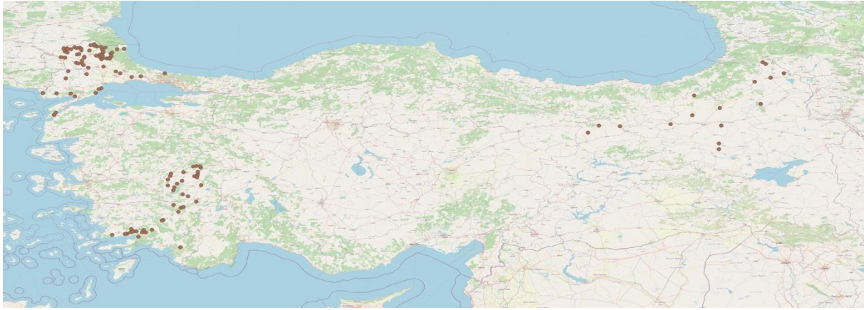
Fig.1. The localities where zygaenid moths were sampled during the study.