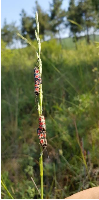
Fig. 2. Zygaena (Agrumenia) carniolica . Edirne, Karamahmut, 40°42'52" N; 26°45'17" E, 310 m. Photo: F. Can.

Zygaena (Zygaena) dorycnii Ochseneheimer, 1808 (Fig. 5): B3 , 07.VII.2021, 1♂, 1♀, leg. M. Koyuncu; B4 , 08.VII.2021, photo: E. Karaçetin; B5 , 08.VII.2021, photo: E. Karaçetin; B7 , 11.VII.2021, photo: E. Karaçetin; B8 , 13.VII.2021, photo: E. Karaçetin; B9 , 14.VII.2021, photo: E. Karaçetin; B11 , 30.VII.2021, photo: E. Karaçetin; B12 , 31.VII.2021, photo: E. Karaçetin; B13 , 03.VIII.2021, photo: E. Karaçetin; B15 , 05.VIII.2021, photo: E. Karaçetin; B16 , 05.VIII.2021, photo: E. Karaçetin.