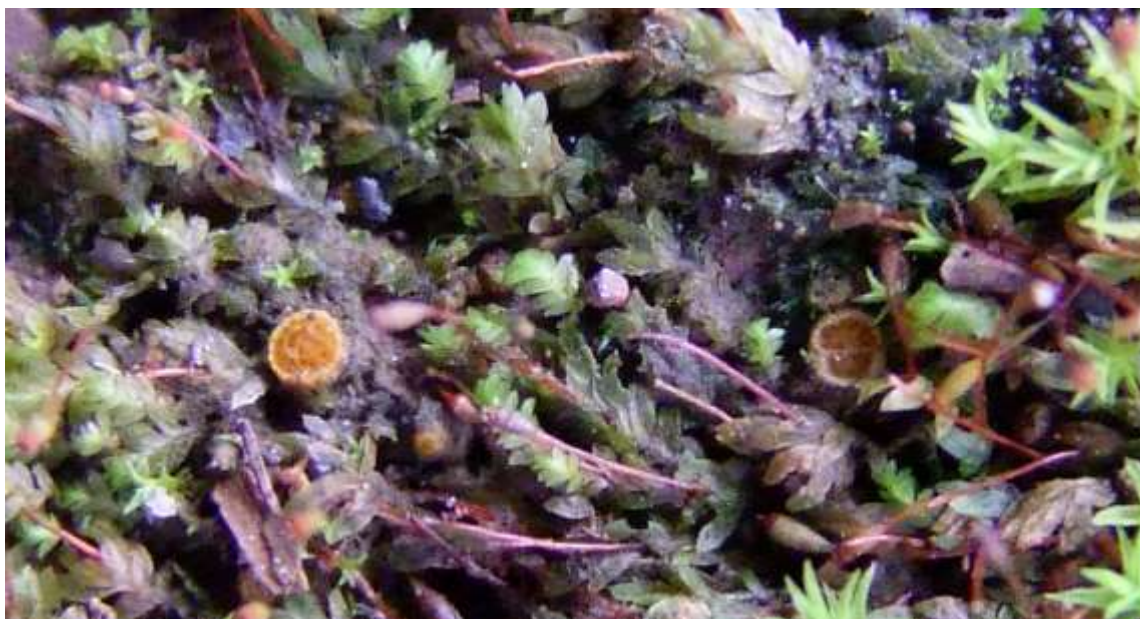
Figure 1. Ascocarps of Octospora tuberculata .

Specimen examined: TÜRKİYE - Gaziantep, İslahiye, Hanağzı village, on moss, 37°03'N-36°36'E, 535 m, 28.03.2015, K.11543; Giresun, Dereli, Kümbet plateau, roadside, on sandy soil with Pleuroidium sp., 40°37'N-38°26'E, 1190 m, 18.10.2017, Yuzun 5914.