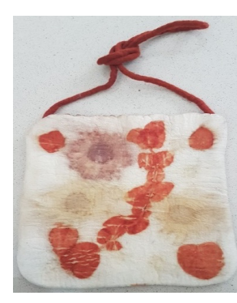
Example, (Altınkaya, 2021)