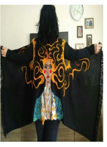
Photograph. Felt Vest Example, (Sevinç, 2021)