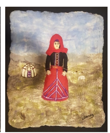
Photograph. Felt Table Example, (Yalçınkaya, 2021)