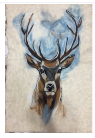
Example, (Kondal, 2021)