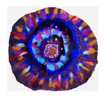
Photograph. Felt Universe Example, (Oyman, 2021)