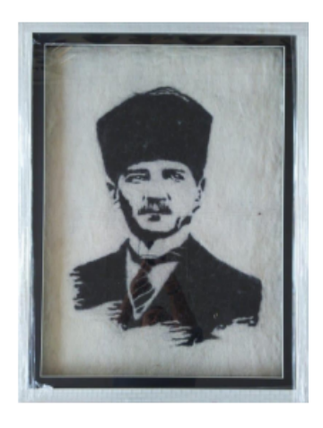
Photograph. Felt Portrait