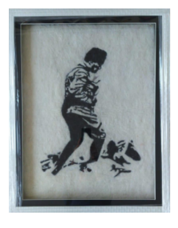
Photograph. Felt Portrait Example, (Kılıç Karatay, 2021) Example, (Kılıç Karatay, 2021)