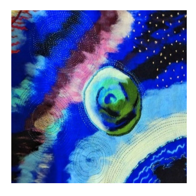
Photograph. Felt Universe Example, Photograph. Felt Universe (Oyman, 2021)