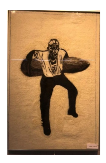
Photograph. Felt Table Example, (Kondal, 2021)