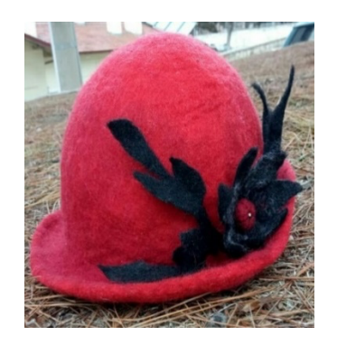
Photograph. Example, (Küçükkurt, 2021) (Sevinç, 2021)