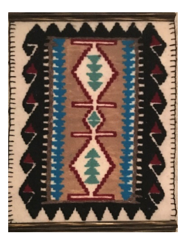
Photograph. Felt Rug Example, (Kılıç Karatay, 2021)