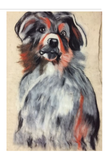
Photograph. Felt Table Example, (Kondal, 2021)