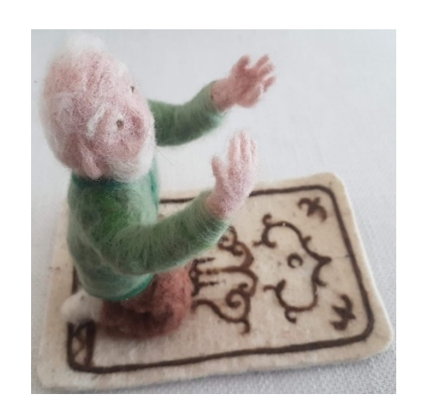
Photograph. 'Praying person' obtained Photograph. Felt Bag (Altınkaya, 2021)