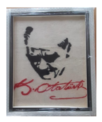
Photograph. Felt Portrait Example, (Kılıç Karatay, 2021)