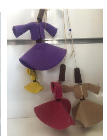
Photograph. Felt Keychains with Felt, (Kondal, 2021)