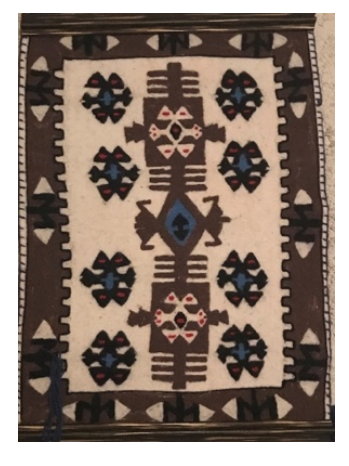
Photograph. Felt Rug Example, (Kılıç Karatay, 2021)