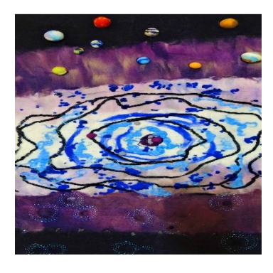
Photograph. Felt Universe Example, (Oyman, 2021)