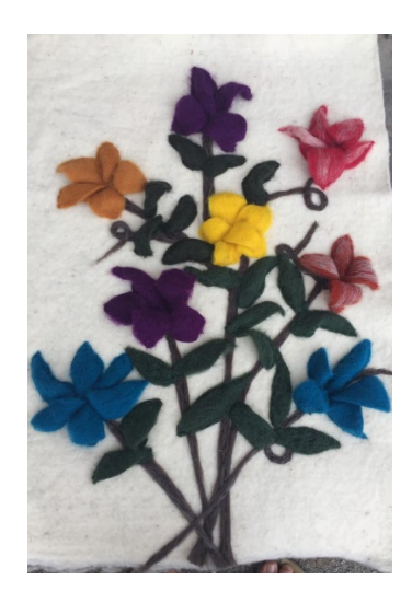
Photograph. Felt Table Example, (Kondal, 2021)