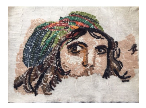
Photograph. Felt Table Example, (Kondal, 2021)