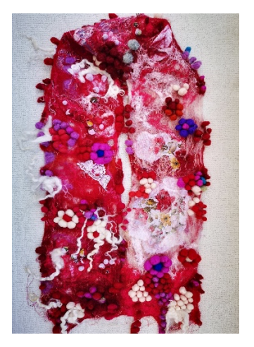
Photograph. Felt Scarf Example, (Küçükkurt, 2021)