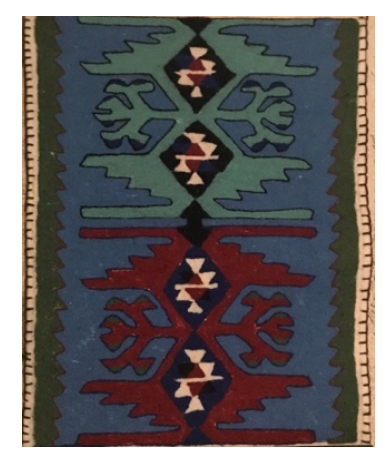
Photograph. Felt Rug Example, (Kılıç Karatay, 2021)