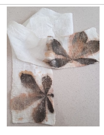
Photograph. Felt Scarf Example, (Yalçınkaya, 2021) Example, (Küçükkurt, 2021)