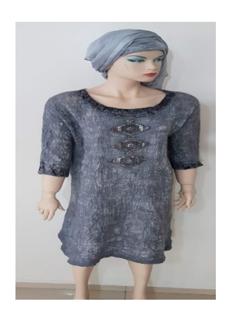
Photograph. Felt Dress Example, (Yalçınkaya, 2021)