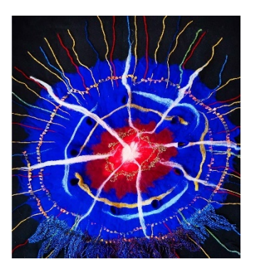
Example, (Oyman, 2021)