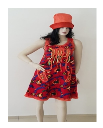
Photograph. Felt Dress Example, (Yalçınkaya, 2021)