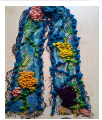
Photograph. Felt Scarf Example, (Küçükkurt, 2021)