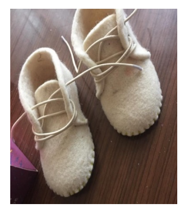
Photograph. Felt Shoes Example, (Kondal, 2021)