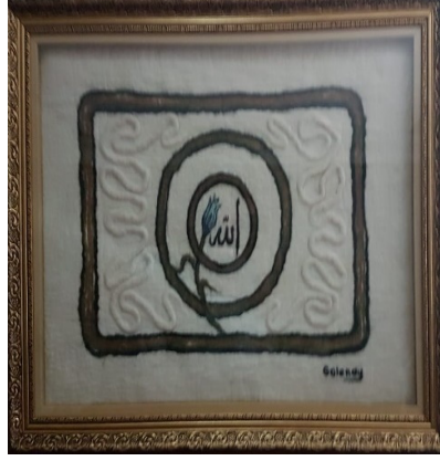
Photograph. Felt Table Example, (Yalçınkaya, 2021)