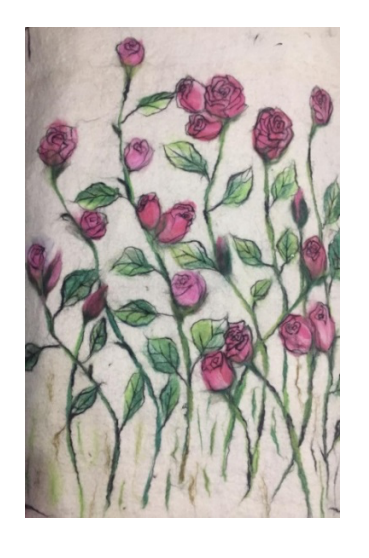
Photograph. Felt Table Example, (Kondal, 2021)