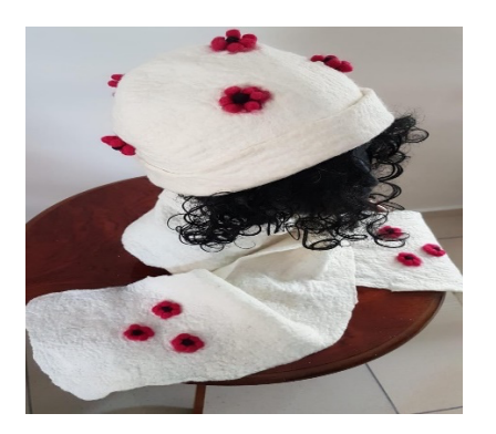
Hat Photograph. Felt Hat Example, Photograph. Felt Scarf and Hat Example, (Altınkaya, 2021)