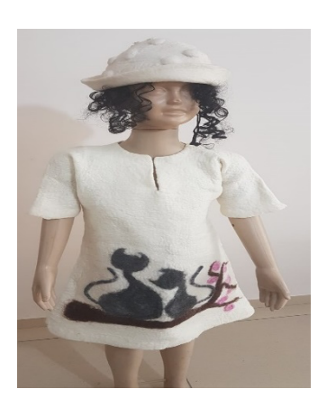
Photograph. Felt Dress Example, (Yalçınkaya, 2021)