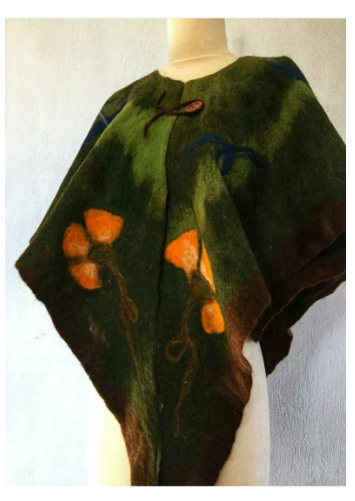
Photograph. Felt Poncho Example, (Sevinç, 2021)