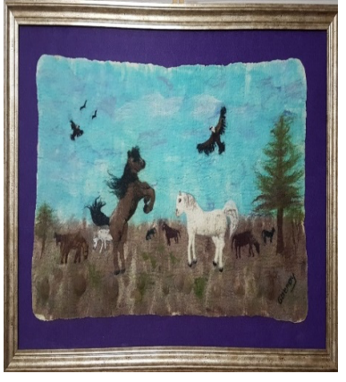
Photograph. Felt Table Example, (Yalçınkaya, 2021)