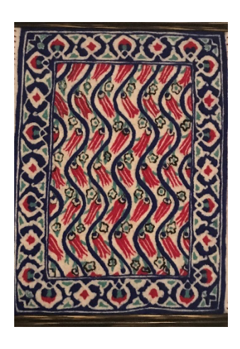
Photograph. Felt Rug Example, (Kılıç Karatay, 2021)