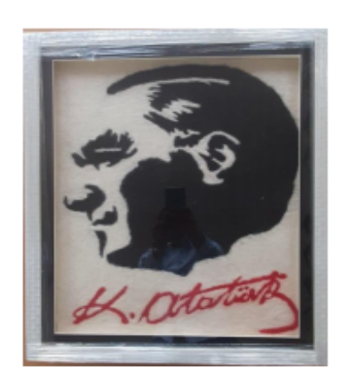
Photograph. Felt Portrait Example, (Kılıç Karatay, 2021)