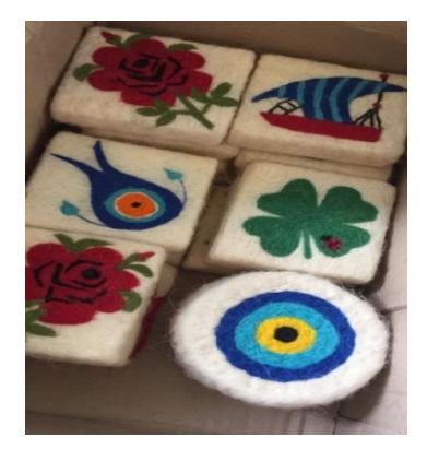
Photograph. Felt Gift Soap Examples, (Kondal, 2021)