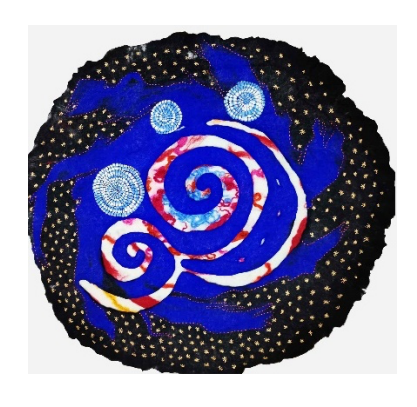
Photograph. Felt Universe Example, Photograph. Felt Universe (Oyman, 2021)