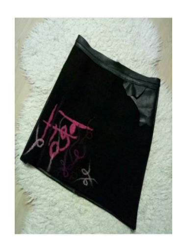
Photograph. Felt Skirt Example, (Sevinç, 2021)