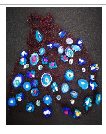
Photograph. Felt Scarf