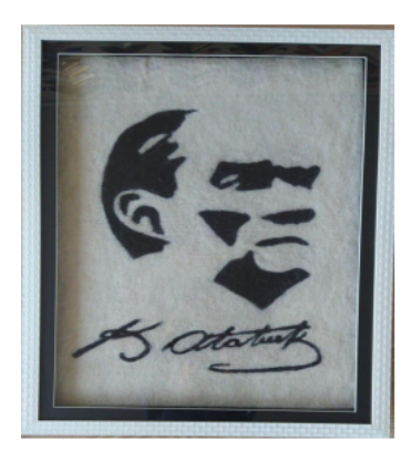
Photograph. Felt Portrait Example, (Kılıç Karatay, 2021)