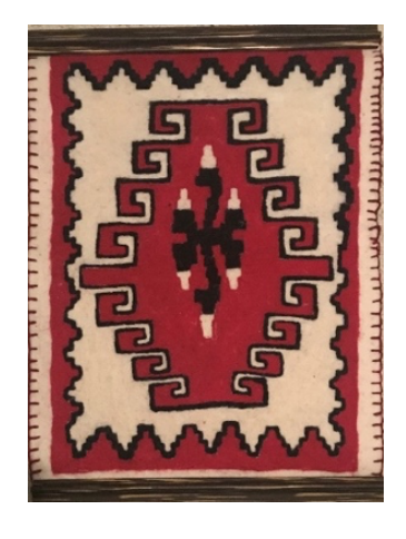
Photograph. Felt Rug Example, (Kılıç Karatay, 2021)