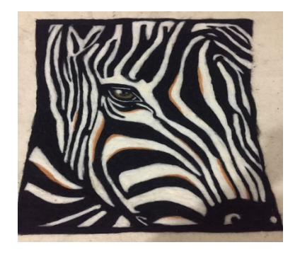
Photograph. Felt Table Example, (Kondal, 2021)