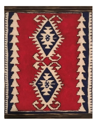
Photograph. Felt Rug Example, (Kılıç Karatay, 2021)