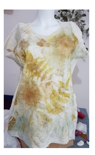
Photograph. Felt Tunic Example, (Yalçınkaya, 2021)