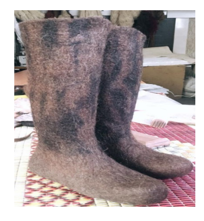
Photograph. Boots Made with Felt Example, (Kondal, 2021)