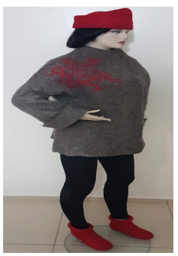
Photograph. Felt Jacket, Hat and Sandle Example, (Yalçınkaya, 2021)