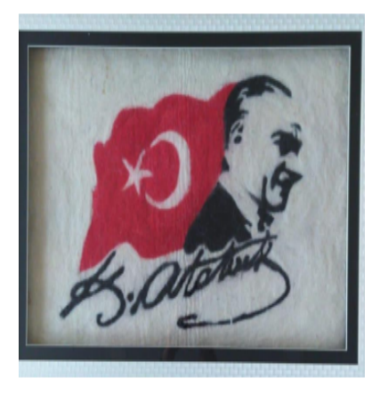
Photograph. Felt Portrait Example, (Kılıç Karatay, 2021)