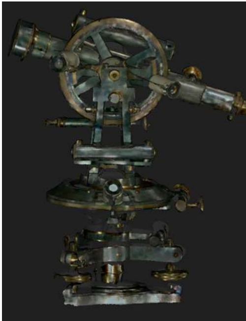
Figure 7. 3D scanning model of the theodolite.