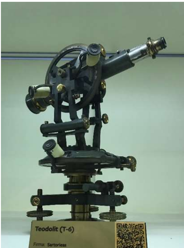
Figure 4. Historical theodolite

Theodolites are precision optical instruments capable of measuring horizontal and vertical angles, distances and dimensions between points, lines and objects in open areas or fields. The Theodolite tool appeared on the stage of history for the first time in 1571, when Leonard Digges defined it as "Theodolitus" in his book "Pantometria". The theodolite used in our study is dated the 19th century and was produced by the Sartorius firm (Fig. 4).