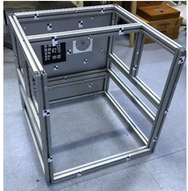
Figure 5. Image capturing platform.

While establishing the local coordinate system, firstly, two polygon points were established in order to calculate the forward estimation. Horizontal open, vertical angle and distance measurements were carried out from the points to the points in the test area with the help of a total station. A total of approximately 25 control points have been established on this test point (Fig. 5).