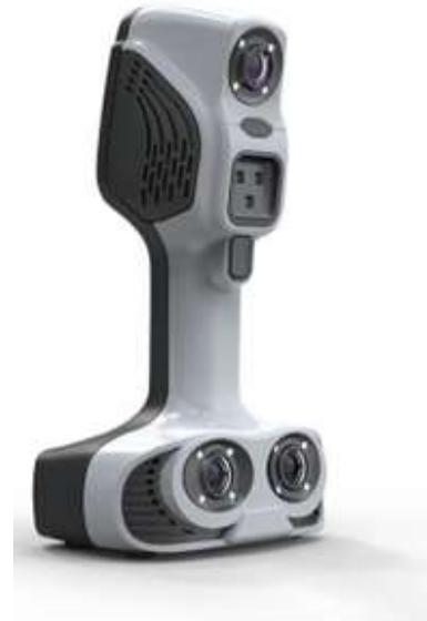
Figure 2. 3D scanner used in the study

An alternative to conventional laser scanners is structured light scanners. Structured Light is a method used for 3D reconstruction of surfaces, working with a method similar to triangulation (Schmalz et al., 2012). The triangulation principle, which can be accepted as the working principle of the structured light (Atik and Duran, 2021), is shown in Fig. 3. The 3D coordinates of an object point can be reconstructed in a calibrated system. In structured light scanners, one or more light patterns are projected onto a scene and observed by a camera. When light hits the surface of the artifact, it is distorted by the specific geometry available captured by a camera (Gebler et al., 2021). Captured images are then analyzed, allowing the depth and surface information of objects to be calculated based on the distortion that has occurred. In this way, the geometry of the artifact can be estimated, and thus a 3D model can be reconstructed (Xin et al., 2008).