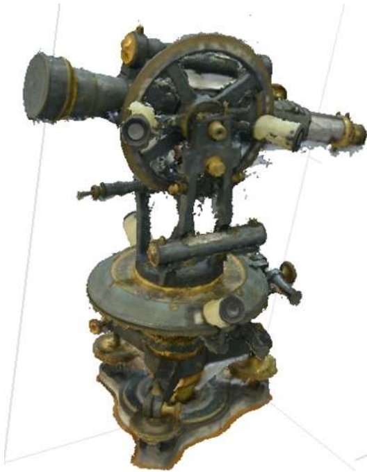
Figure 6. Photogrammetric model of the theodolite