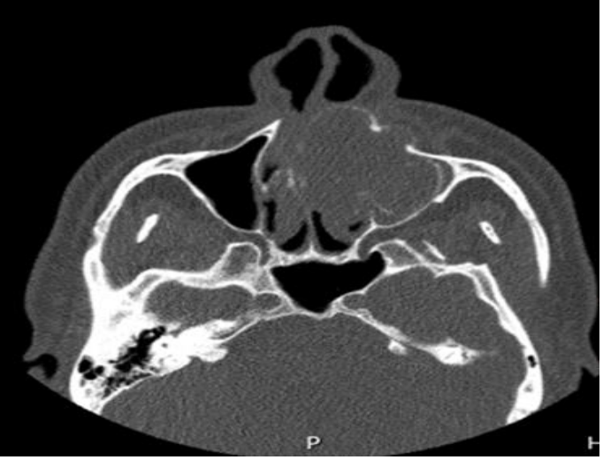
Figure 3. The appearance of the lesion on axial CT.

It was decided to remove the lesion with general anesthesia. After nasal intubation, relaxing vertical incisions were made in addition to the gingival sulcus incision in the left maxillary region, and the anterior border of the maxilla was reached, and it was observed that the lesion destroyed the anterior wall of the maxilla. (Figure 4) Osteotomies were performed to reach the center of the lesion. Blunt dissection was used to separate the lesion from the soft tissue. After the lesion was curetted completely, a gas iodoform tampon was placed