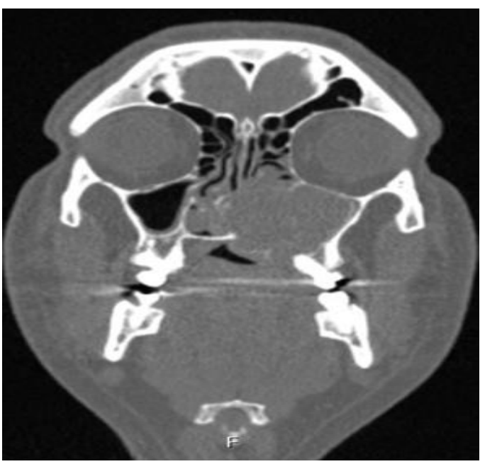
Figure 2. The appearance of the lesion on coronal CT.