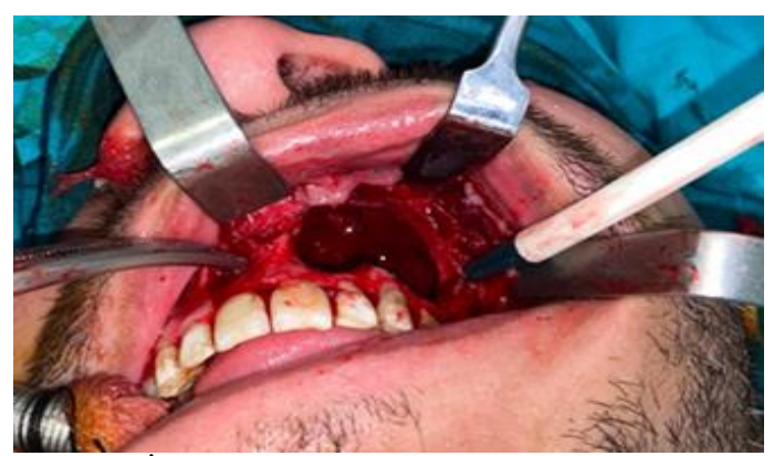
Figure 4. Intraoperative image.

in order to provide hemostasis and to support the regeneration of the maxillary sinus tissues. (Figure 5) Gas iodoform tampon was passed through the lateral wall and sutured to the nasal cavity with 3-0 silk sutures. The wound margins were also sutured. (Figure 6) The tampon was removed from the nasal cavity after two days.