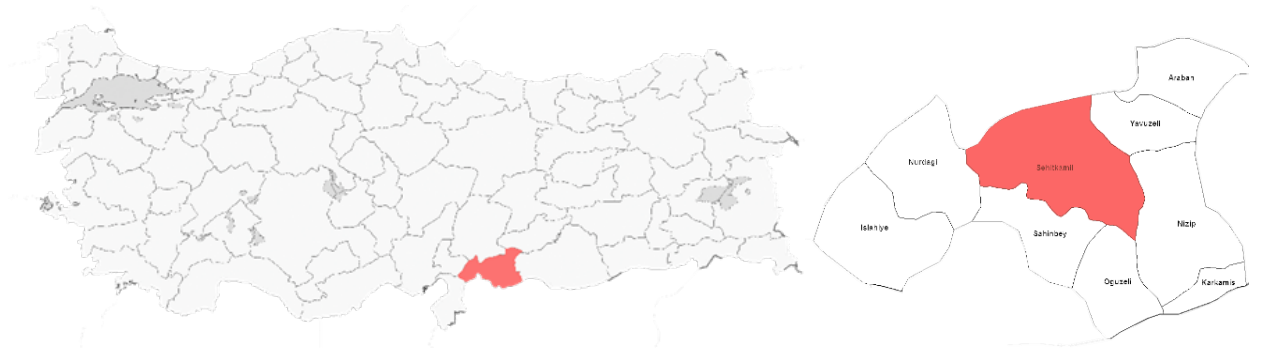
Figure 1. Turkey map and Gaziantep city boarder

The commercial areas are dominated by different shops: grocery shops, clothing stores, gold shops, food shops, etc. The street has multi-story buildings, in which shops occupy the ground floor and the first to third floors house apartments. It also includes a mosque, post office, banks, police center, intermediate school, traditional Turkish restaurants, and many other activities. The street has been selected as a case study due to its economic importance and the location's potentialities, which can increase the vitality of the street and improve its functional performance efficiency. As this street is located near the Zeugma Museum, the most famous and iconic place in Gaziantep city. For evaluating the attributes, the survey was conducted to obtain people's viewpoints on the identified attributes. In addition, in-depth open interviews with participants, who were very familiar with the streets, were questioned to understand more about people's perspectives on their neighbourhood and life issues.