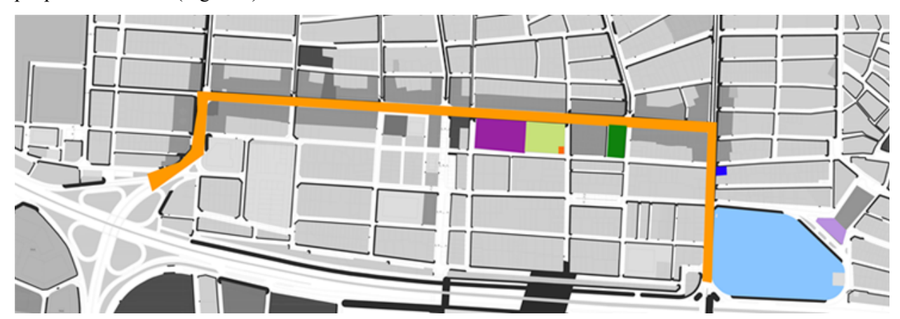
Figure 4. The photo shows the connection between Korutürk street and Zeugma Mosaic Museum (In Blue color)

Diversity is one of the most important indicators of liveability; this diversity increases interaction between people and leads to variation in their activities and stimulation [4]. Diverse and lively functions encourage people to use the street and increase interaction between people and leads to variation in their activities. The combination of several uses in the area attracts people and makes the environment safer, especially at night. These functions could include providing high-quality public facilities and playgrounds for children and cultural activities. Moreover, the connection between the Zeugma Mosaic Museum and Korutürk street should be improved to attract more tourists to the street. The museum is an important icon to the city and an attraction point to tourism. The connected street should be well designed and clearly defined to invite people to the street (Figure 4).