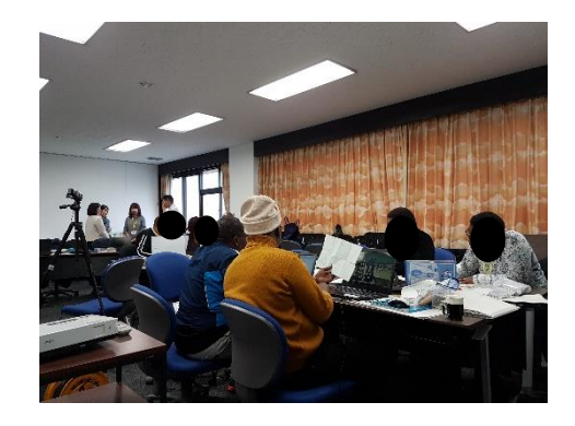
Figure 3. SA Teachers in Japan: LS Reflection Author's own Photo in Japan with Delegates