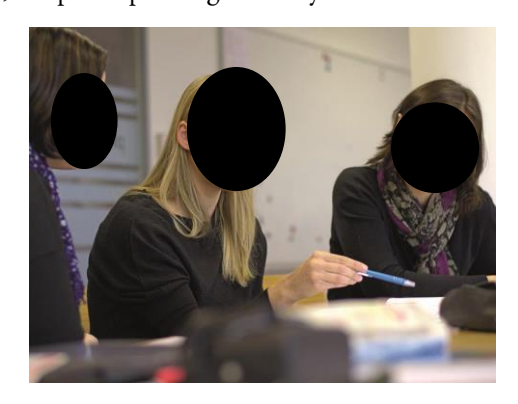
Figure 2. Teachers Engaging in LS Planning

From the participants' quotes, it is encouraging to note that the lesson study has positively impacted all participants. To probe further into their experiences, the researchers asked the participants what some of the challenges they experienced with lesson study were. According to T2-G1-F, she said, "In the beginning, it was overwhelming and scary for me. I am a newly qualified teacher, and I have to teach a lesson in front of my more experienced colleagues." T1-G1-F and T3-G1-F both indicated that their challenge was the lesson study cycle. The cycle required all teachers to meet and discuss the lesson at each week's end. They both agreed that time was a significant challenge for them. Despite this challenge, the participants agreed they needed to meet weekly to improve their lesson study.