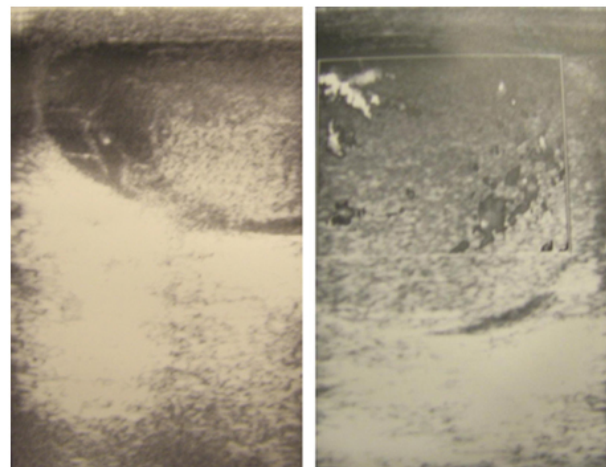
Figure 1: Doppler ultrasonographic examination of the left testis revealed increase in testicular blood flow and size with epididymal echogenicity. A pyocele like appearance was also observed in the left hemiscrotum.

Thereafter, with a suspicion of Brucella-induced orchitis, Brucella spot and Wright agglutination tests were performed and each of them were found to be positive (the latter in a titer of 1/160). Among the former cultures which were taken during the admission period, bacteria in Brucella morphology were isolated from the blood culture but the urine culture was sterile. Relying on these clinical findings the patient was diagnosed as Brucella orchitis and medication composed of tetracycline in 100 mg p.o. b.i.d. and rifampicin 600 mg/day p.o. was started and continued for a 6-week period. Endocarditis and any cardiac involvement due to Brucellosis were ruled out by echocardiography. The symptoms completely resolved at the second week of treatment.