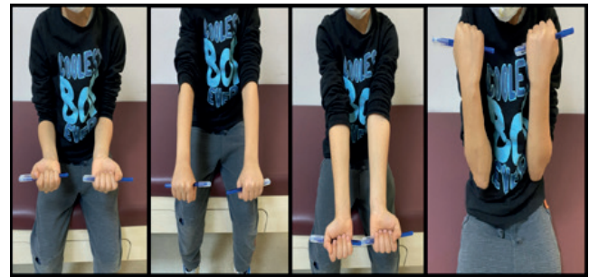
Figure 4. Functional results at the 1-year follow-up

Bado suggested that Monteggia type I and equivalent lesions can be treated by closed reduction with a supination maneuver. In a type I equivalent lesion, if the ulna or proximal radius fracture is unstable, intramedullary fixation should be made with a Kirschner wire [1] .