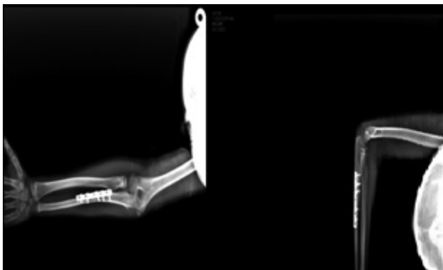
Figure 3. Follow-up images