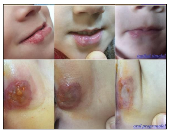
Figure 1. Photographs of two of our patients with deep hemangiomas at the time of admission and at the first and fourth months after topical and oral propranolol treatment.

The mean hemangioma size in the topical timolol group was 237.50 mm<sup>2</sup> at admission, 187.50 mm<sup>2</sup> during the first month, and 150.00 mm<sup>2</sup> in the fourth month. In superficial hemangiomas, no significant difference was observed during the follow-up period in the topical timolol group after