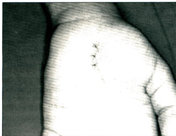
Fig.2 : Immediate postoperative view of the incision.

average operation time was 25 minutes. The patients were followed for an average of 2 years and all had full recovery with no complications.