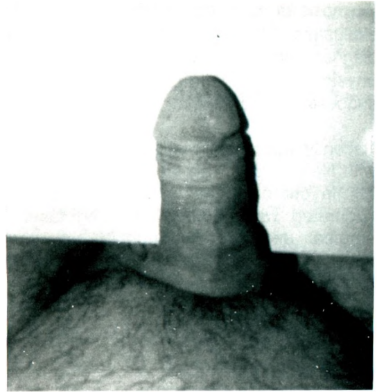
1 b: Appearance 12 months after surgery.