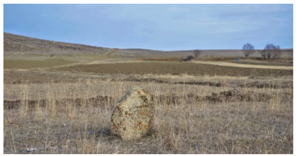
Fig. 16: Adabası Milestone

Koyaklar Tepe/Adabaşı Castle is located in the borderland between Trabzon and Bayburt Provincesand is very close to the historical route from Trabzon to Aydıntepe.<sup>55</sup> On this route, Sürmene-Kava Plain-Aşot-Limansuyu-Aydintepe road holds the shortest distance from Trabzon to Bayburt and Erzurum. the travelers who came to the region in the 19th century declared that the road mentioned was a busy road used by the locals until the early 20th century.<sup>56</sup> During archaeological surface surveys we conducted in the region, we found a 1 m height milestone, the lower part of which was mostly covered with soil, approximately 200 m south of the castle, close to the Koyaklar Hill (Fig. 16). This milestone, which possibly belonged to the Ottoman Period, was recorded as supporting evidence for the road's active use in those times.