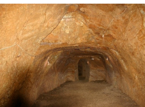
Fig. 10: Aydıntepe Castle