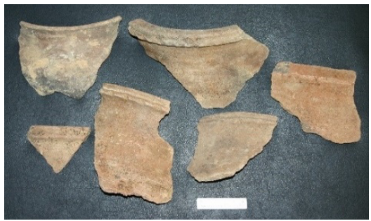
Fig. 12: Aydıntepe Ceramic Samples