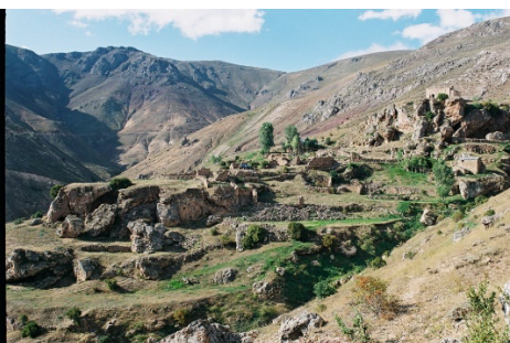
Fig. 23: Krom Valley