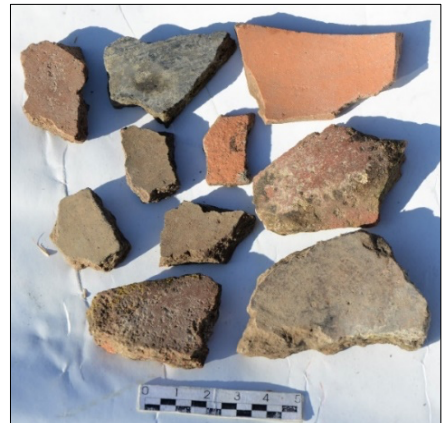
Fig. 18: Korgan Ceramic Samples

Procopius mentions that a large castle named Bourgousnoes (Βουργουσνόης), also known as Longinos' Encampment (Λογγίνου φοσσᾶτον) by the locals, was built to the