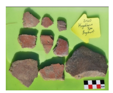
Fig. 15: Koyaklar Ceramic Samples