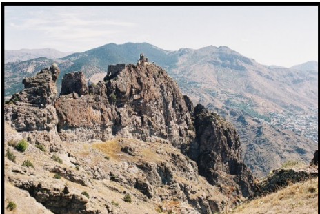
Fig. 21: Canca Castle