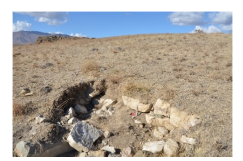
Fig. 14: Koyaklar Hill Castle

Procopius recorded that further of the east of Charton, there was a steep valley towards the north, and a castle was built there, named Barchon (B\alpha\rho\chi\acute{\omega}v) . <sup>54</sup> Based on the Charton-Aydıntepe match, the most suitable location for this description of Procopius is Koyaklar Tepe Castle, located within the borders of Adabaşı Village, approximately 18 km northeast of Bayburt proper. The fortification walls of this castle, which were built on a steep and rocky hill overlooking the Düzüker Plains, 3 km west of Adabaşı Village, can be partially traced at the foundation level (Fig. 14, 15). This slightly graded land on the riverbanks is protected by the river on the west side, and by rocky cliffs and a hill crest on the northern and eastern sides.