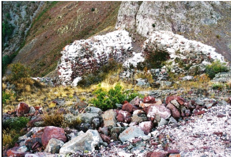
Fig. 19: Kov Castle