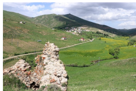
Fig. 8: Akhisar Castle