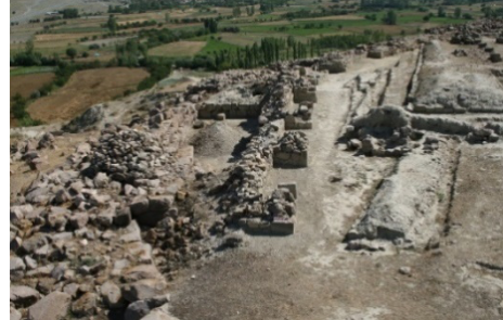
Fig. 6: Altintepe Tombs.