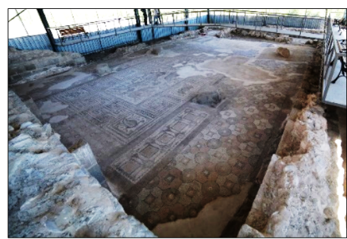
Fig. 5: Altıntepe Church