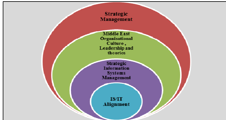
Figure-2: IS Alignment Context:

The scope of this research is to explore IS alignment in developing countries, which are investing a large amount of their budgets in transferring IT. However, there is a deficiency in terms of a common understanding of the concept of alignment between IS strategy and business strategy in developing countries that can lead to an increase in time and wasted effort and an increase in costs, all of which result in the creation of a negative environment for IT investment (Alfaouri, 2004).