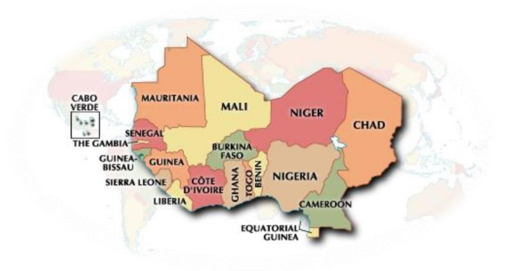
Figure 1: The countries of western Africa.

paper explains the increasing trends of violent extremism in West Africa and outlines the factors influencing extremism in the sub-region. The paper also considers the responses of individual member states in the sub-region and suggests how to curb the increasing threat of violent extremism in the sub-region. The paper is in different sections. The first section gives an outline of the methodology adopted for the discussion. The second section of examines literature on the emergence of violent extremism and some terminologies associated with the duo concepts of terrorism and violent extremism. The third section analyses the emerging trends of violent extremism in selected countries in West Africa, highlighting the root drivers of extremism and their economic and security implications. Based on the analysis in section three, the fourth section will highlight the current strategies adopted by the regional leadership to combat violent extremism. This section also demonstrates what needs to change to prevent violent extremism from further destabilizing in the sub-region. The concluding section summarizes the salient points of the discussion.