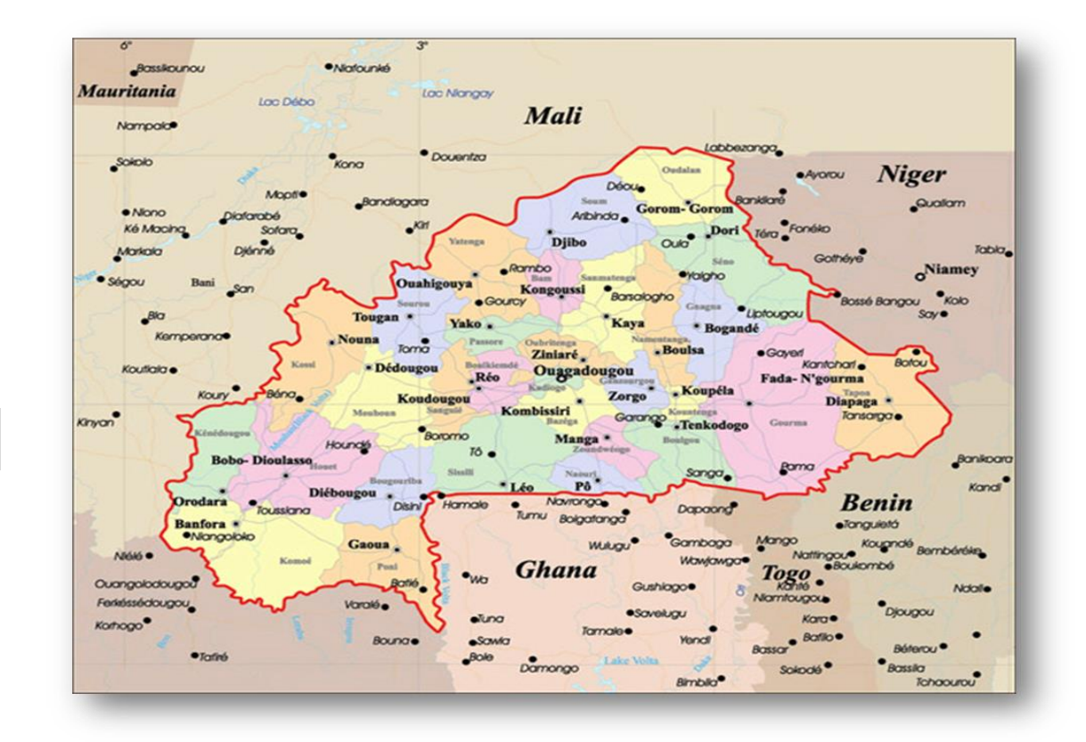
Figure 2: Detailed administrative map of Burkina Faso.

2020; Nsaibia, 2021). This is particularly the case for the provinces of Oudalan and Soum located in the Sahel region. The attacks spread along the 1,325 km border with Mali in the northern part of the country, covering some provinces in the west, such as Kossi, Kénédougou, and Yatenga (Le Roux, 2019). Armed violent extremists operating on the border between Mali and Niger have destabilized the governance structures and infiltrated the security agencies of Burkina Faso, subjecting the country to an unprecedented humanitarian crisis. An estimated 2.2 million Burkinabes, including 1.2 million, were in dire need of emergency humanitarian assistance as of January 2020.