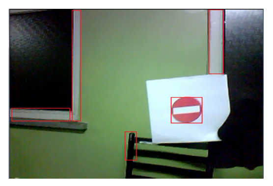
Figure 4 Found objects with blob analysis

In this method, an object in video frames is decided whether is the traffic sign or not. Figure 5 shows, objects are found with blob analsis in video frames.