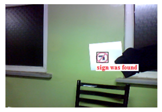
Figure 2 Normal video capture

R: Represents the "red" in RGB color space. G: Represents the "green" in RGB color space. B: Represents the "blue" in RGB color space. Equation 1 shows the conditions for red pixel. If the conditions in the first equation are satisfied, this means the pixel color is red equation 2 and 3 shows the condition of white and black respectivly [8]. In this part, pixel of video frame are labeled whoch are expressed with we defined as numer. Also the other pixels in video frame are assigned fixed numerical values. In this way, the traffic sign is marked in video frame. Normal video capture is shown in Figure 3.