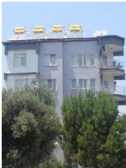
Figure 3. Sample Building Analysis

In a solar power system, working at its most basic principle, the type of utilization is water heating.