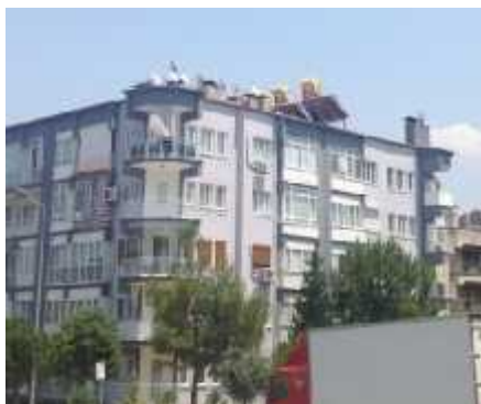
Figure 6. Sample Building

The sample building, seen in image 6 and 7 is a residential structure, located within the Mediterranean climate conditions in Turkey. Solar