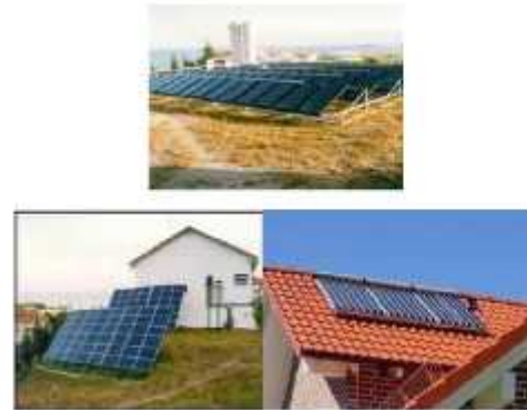
Figure 1. Collector Samples [3]

collectors usually have a concave surface in order to increase the flow of radiation and by focusing the solar rays onto a small area, they provide high temperatures. The water, air or heat transfer oil can be used in the solar collectors as the heat transfer fluid.