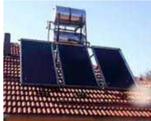
Figure 4. Solar Energy System Analysis [6]

As it is seen from the structure, in which the sample building figure 3 review shall be conducted, this system is preferred in regions, where the Mediterranean climate prevail and this scene is a common one at all. As the coating material; aluminum foil or galvanized metal sheet are preferred.