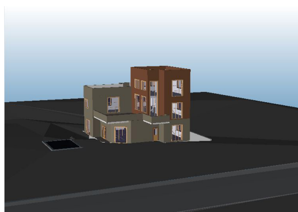
Figure 1: 3D CAD BIM model of a 3 floor steel structure villa [22]

A 3 floor steel structure villa in North Cyprus is taken as a case study (Figure 1).