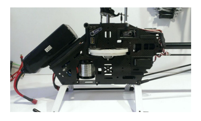
Figure 4. Carbon fiber reinforced epoxy composite chassis.

The weights of vehicles made with aluminium alloy chassis and carbon fiber reinforced epoxy composite chassis were measured and test flights for both vehicles were carried out. Test flights for both vehicles were repeated three times and their flight times were determined.