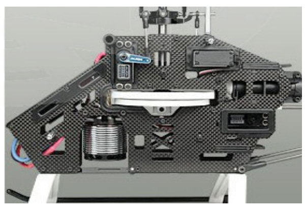
Figure 2. 2024-t3 Aluminium alloy chassis.

repeated for CREC material (Figure 4) on another radio controlled model helicopter.