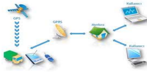
Figure 3. Opeation of GPS

Tender Specification shall require GPS device to be mounted in each school service vehicle, and Transportation fees shall be increased in regard to the cost of these devices. GPS data shall be displayed in the digital map, created in the e-School system. Official personnel from the Provincial/District Directorates for National Education and Primary School Principals shall follow system through this module. This system shall be transferred to Data Informing Module, thus, parents shall be able to monitor the school service vehicle transporting their children from anywhere with internet access. Speed limits that the school service vehicles must obey shall be regulated. Drivers who violate the speed limit shall be reported via the system.