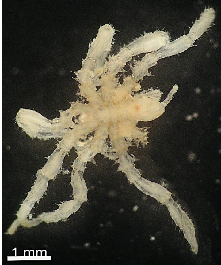
Figure 2. Achelia langi (Dohrn, 1881), ♂, Antalya Bay. Dorsal view.