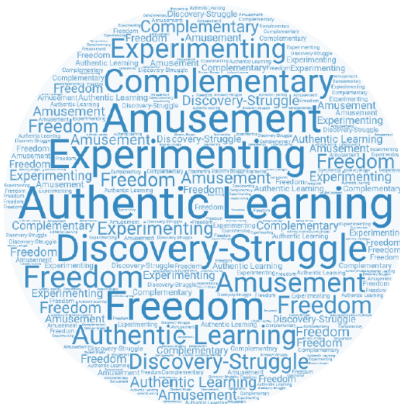
Figure 2. Diagram of Frequency Density of Conceptual Category

set as “Experience, Freedom, Authentic Learning, Reinforcing, Amusement and Discovery-Struggle” and these categories were discussed separately below. While Experiment (n=26) and Authentic learning (n=26) comprise more than half of the analyzed metaphors, Reinforcing (n=14), Freedom (n=9), Discovery-Struggle (n=4) comprise the other half. These metaphors are shown below.