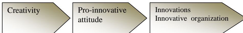
Figure-1.: Relationship between creativity, innovation and pro-innovative attitude