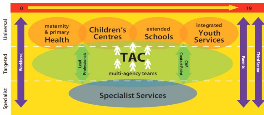
Figure-2: The team around the child (TAC)

For most additional needs, this will lead to targeted support, e.g. from an education psychologist, or speech therapist. However, there may be other needs that cannot be met by one service alone and in this case a 'team around the child' is formed, coordinated by a 'lead professional'. At the furthest end of the scale, the most complex or 'acute' needs might require specialist or statutory services to be brought in. In this case, the statutory agency usually takes over as lead professional in order to coordinate multi-agency assessment and intervention. This model of integrated working is illustrated below: