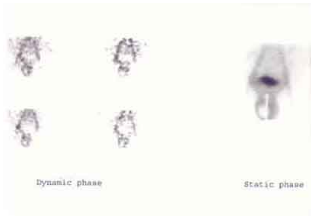
Figure 1: Testicular scintigraphy demonstrated an increased activity in the dynamical phase and a hypoactive center with a hyperactive hologram in the late static phase on the right testis.