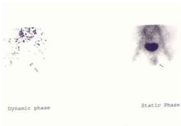
Figure 3: In dynamic phase, the reactivity was increased in the area of the left testis compared with the other side. In the static phase, the activity was diffusely on the left testis (arrows)